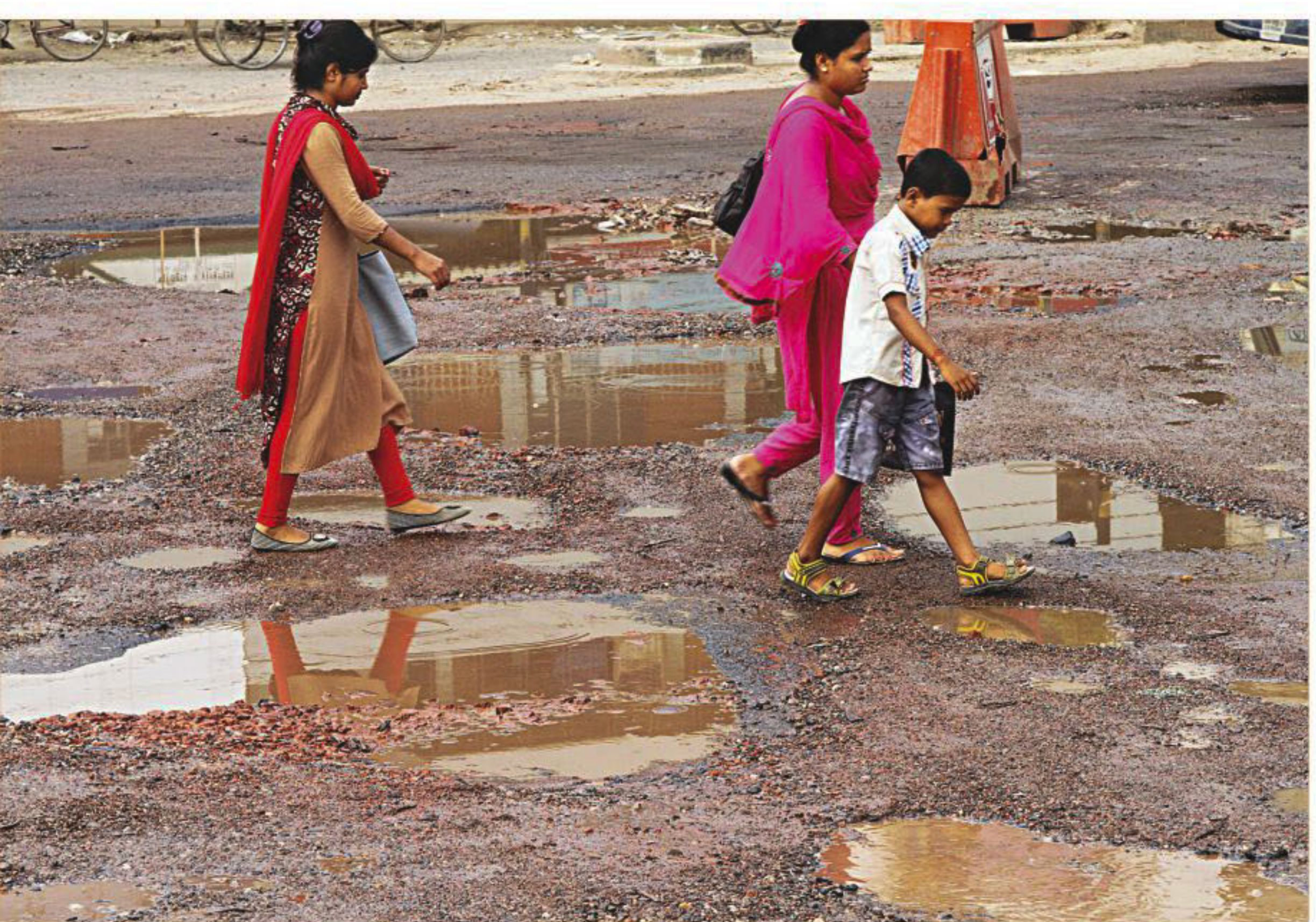
The same scenario was depicted in a photo published in The Daily Star a few months ago but the urgency for repairing the road, situated north of Malibagh Rail Crossing, failed to draw the attention of the authorities concerned. The new photo was taken yesterday.