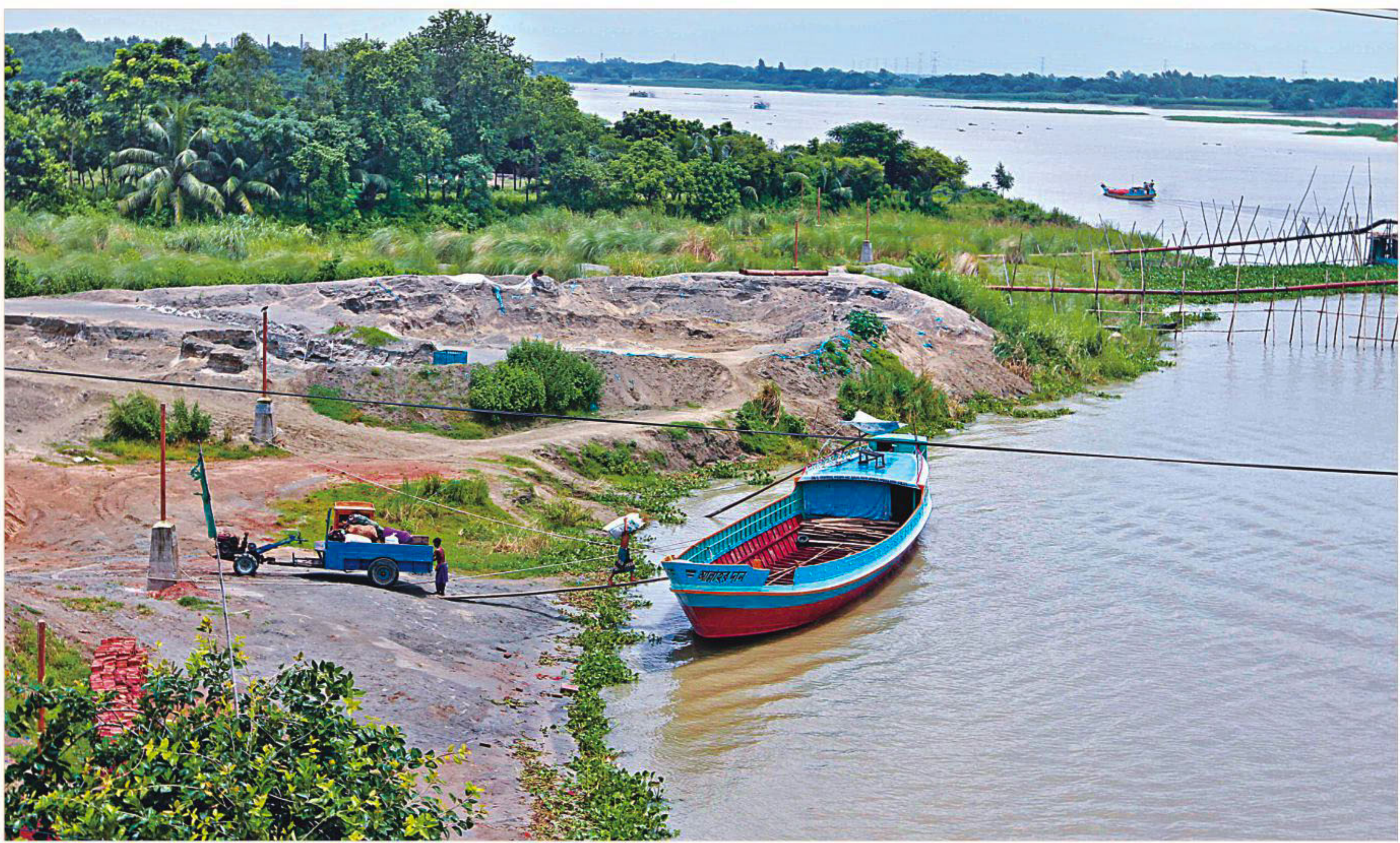
The Dhaleswari river is falling prey to encroachment, a fact revealed from the act of sand being stored for sale by traders beyond the demarcation pillars erected by Bangladesh Inland Water Transport Authority on this portion beside the Dhaka-Mawa highway. The photo was taken recently.