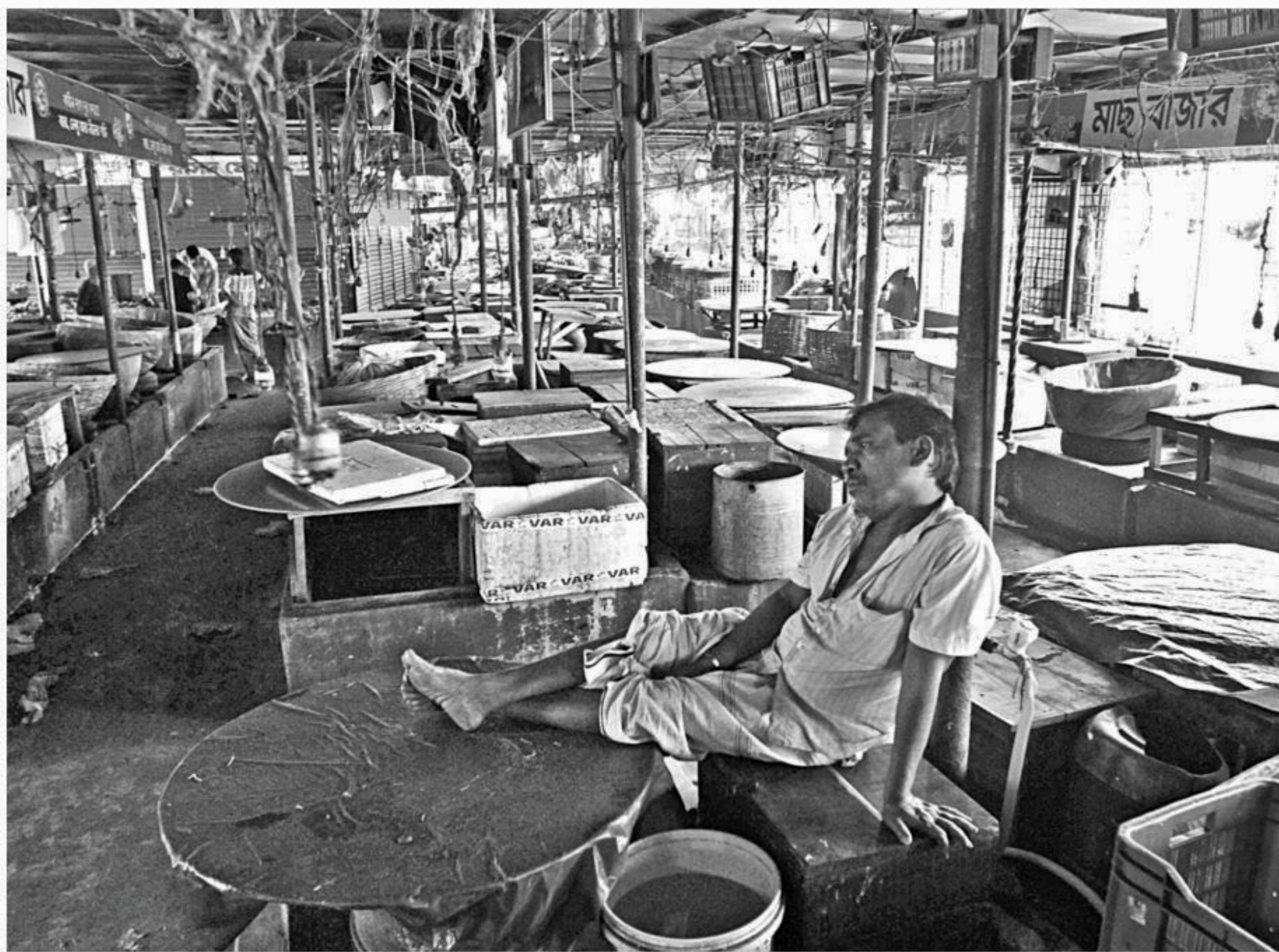
With meat bulging out of people's freezers in the capital right after the Eid-ul-Azha, very few residents feel the need to visit the kitchen markets. So this fish trader at Crescent Market in Malibagh relaxes yesterday with his empty containers lying around.

He has not been able to show any visa or valid entry documents, he added.