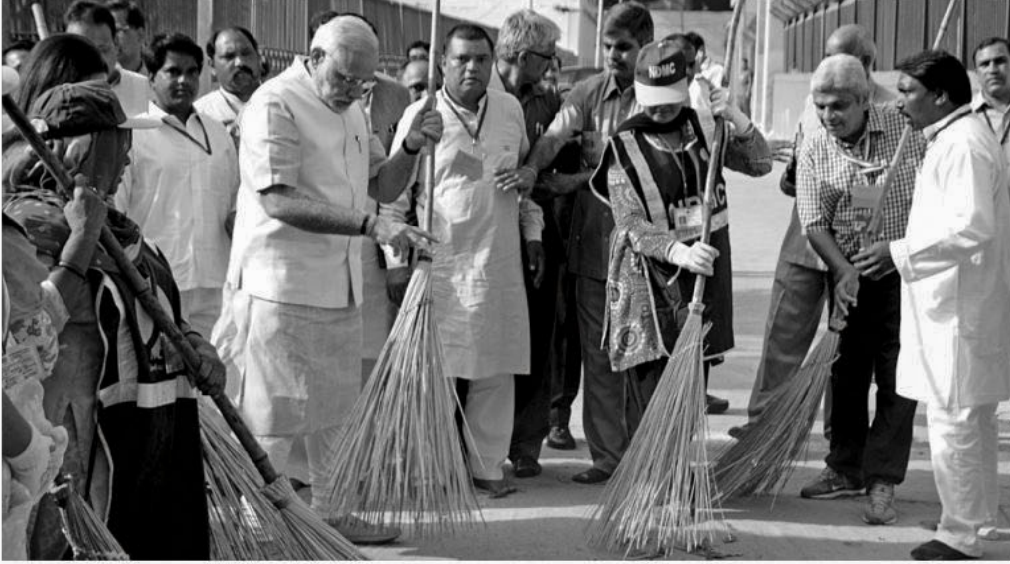
Indian Prime Minister Narendra Modi sweeps a street in a residential colony in New Delhi yesterday.

In several of his speeches since being elected as PM in May this year, Modi has repeatedly emphasised the need for sanitation vowing to make India clean by 2019, to coincide with the 150th birth anniversary of Mahatma Gandhi.