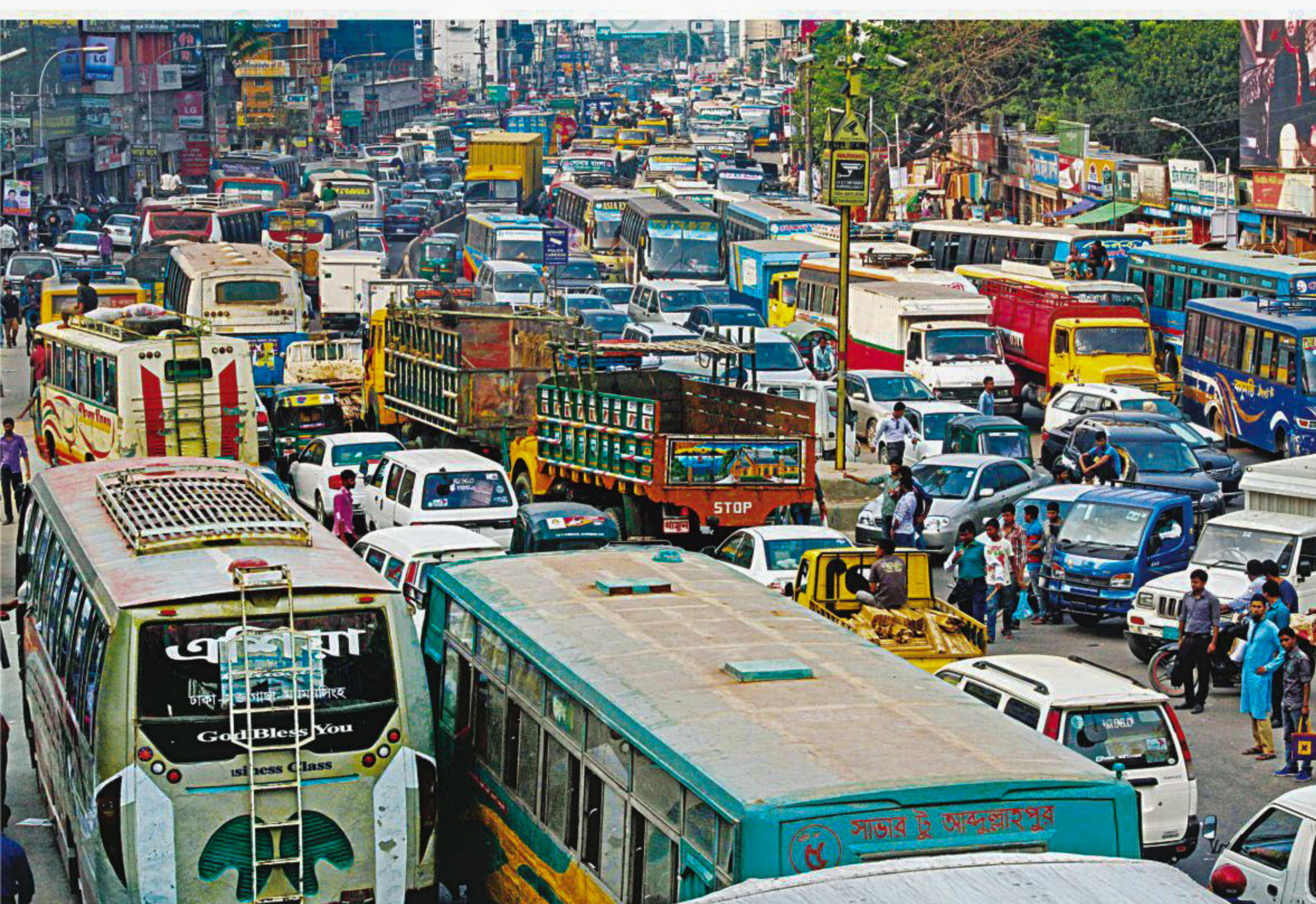
Vehicles caught in heavy congestions on Uttara-Tongi road yesterday. Passengers say this is a regular picture and they blame it on queues of cars at two CNG stations on both sides of Tongi bridge. The photo was taken at the capital's Uttara sector-13 in the afternoon.