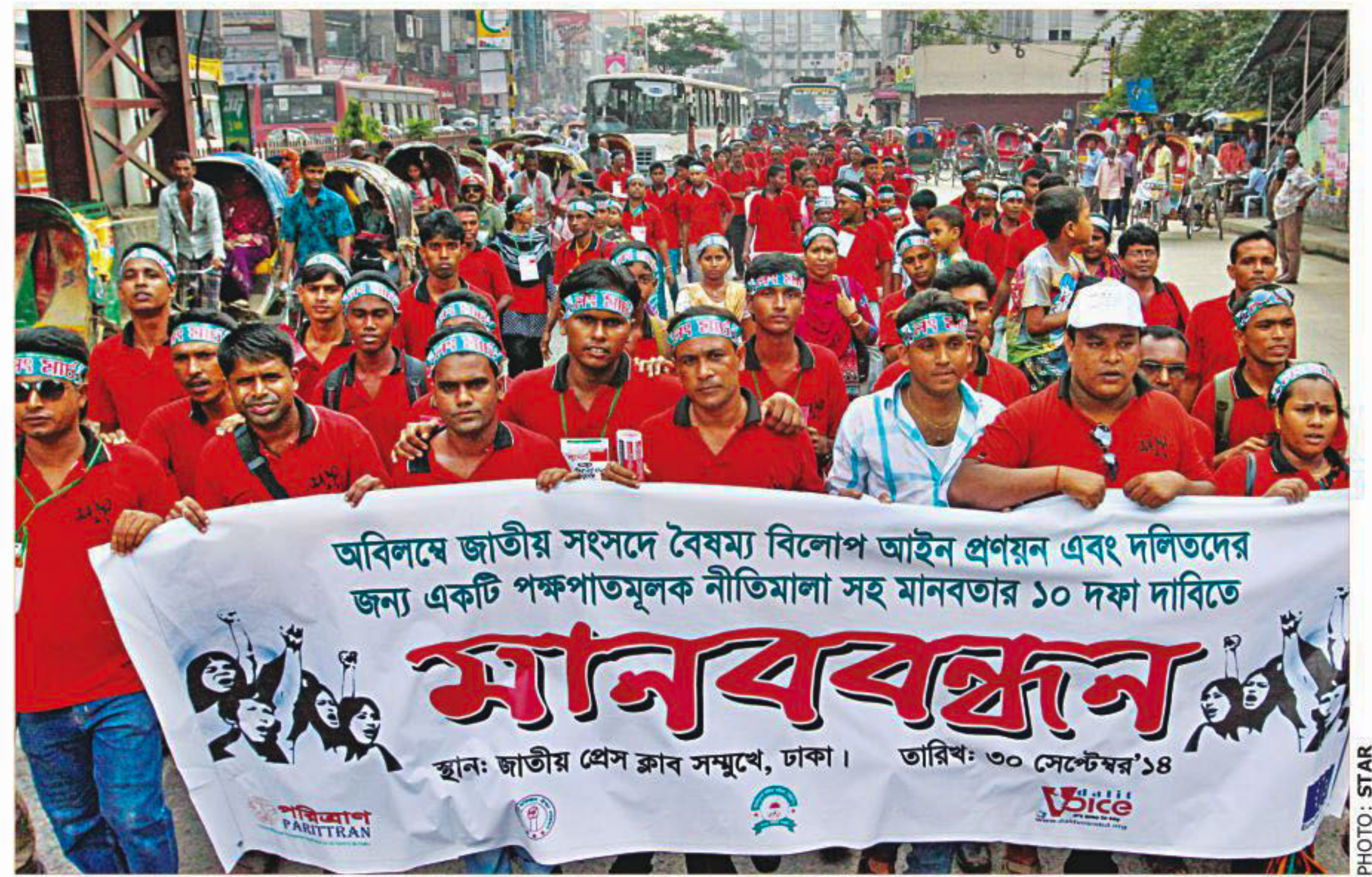
Bangladesh Dalit Parishad brings out a procession before Jatiya Press Club in the capital yesterday demanding that the government enact the proposed Antidiscrimination Act soon and ensure the rights of the community.