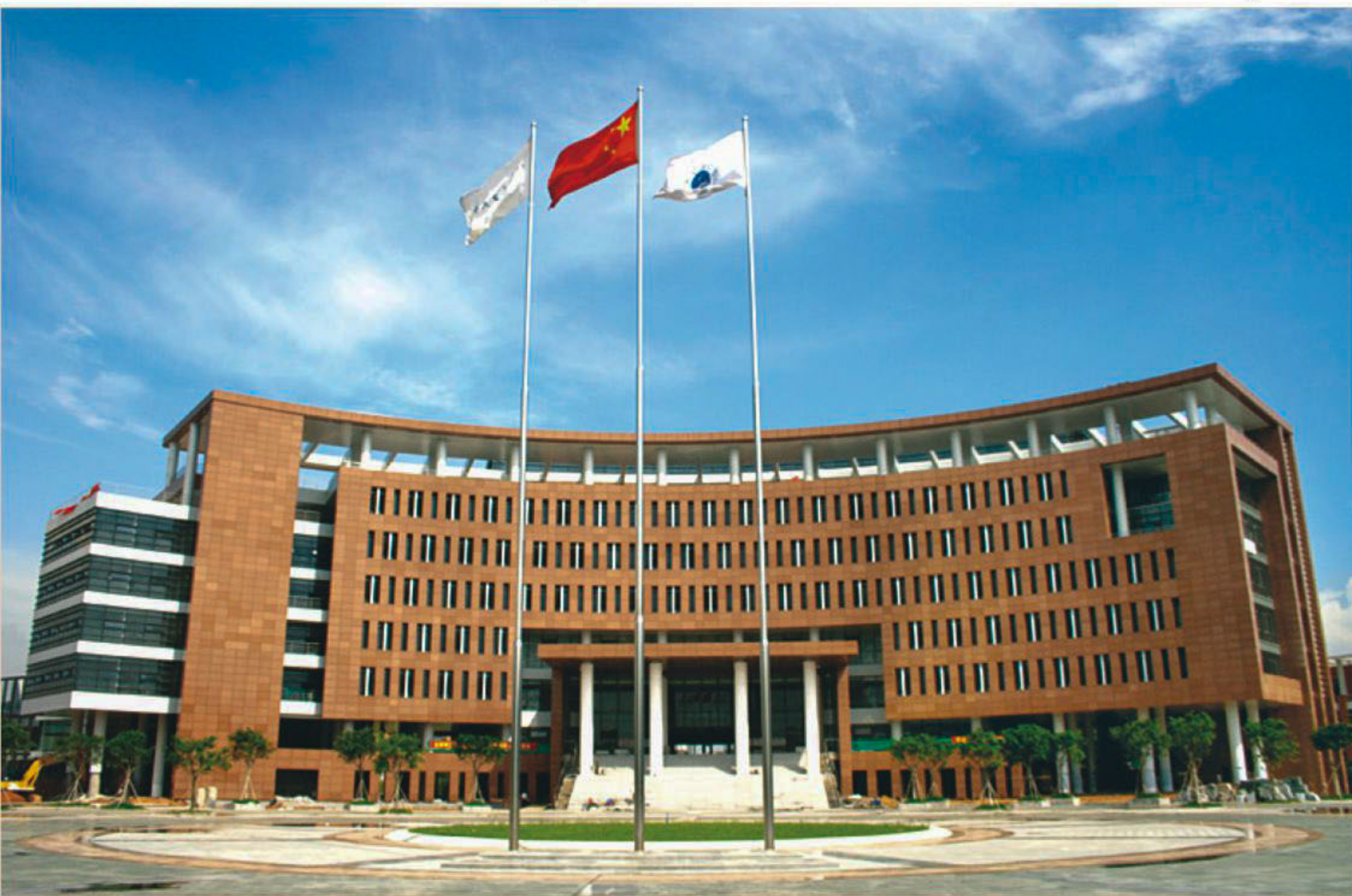
DR. SALEHUDDIN AHMED

CHINA is one of the largest countries (9.6 million Sq. Km) with the highest population (1.3 billion) in the world. The Chinese lifestyle is highly influenced by western culture, even though the Chinese hold their own culture very close. You will find fast food restaurants, supermarkets, departmental stores such as in any western country, in the major Chinese cities. Having said that, the Chinese culture, people, habits, language, food, and interactions are fairly different from what you experience in Bangladesh or any other country. Therefore, any student going for higher studies in China will need to be flexible and enjoy the unexpected: make friends with locals and appreciate the culture around you; sample the wonderful Chinese food; visit the various different areas of the city you decide to stay in or around the country. Most importantly, try to speak the language (Mandarin). You will find