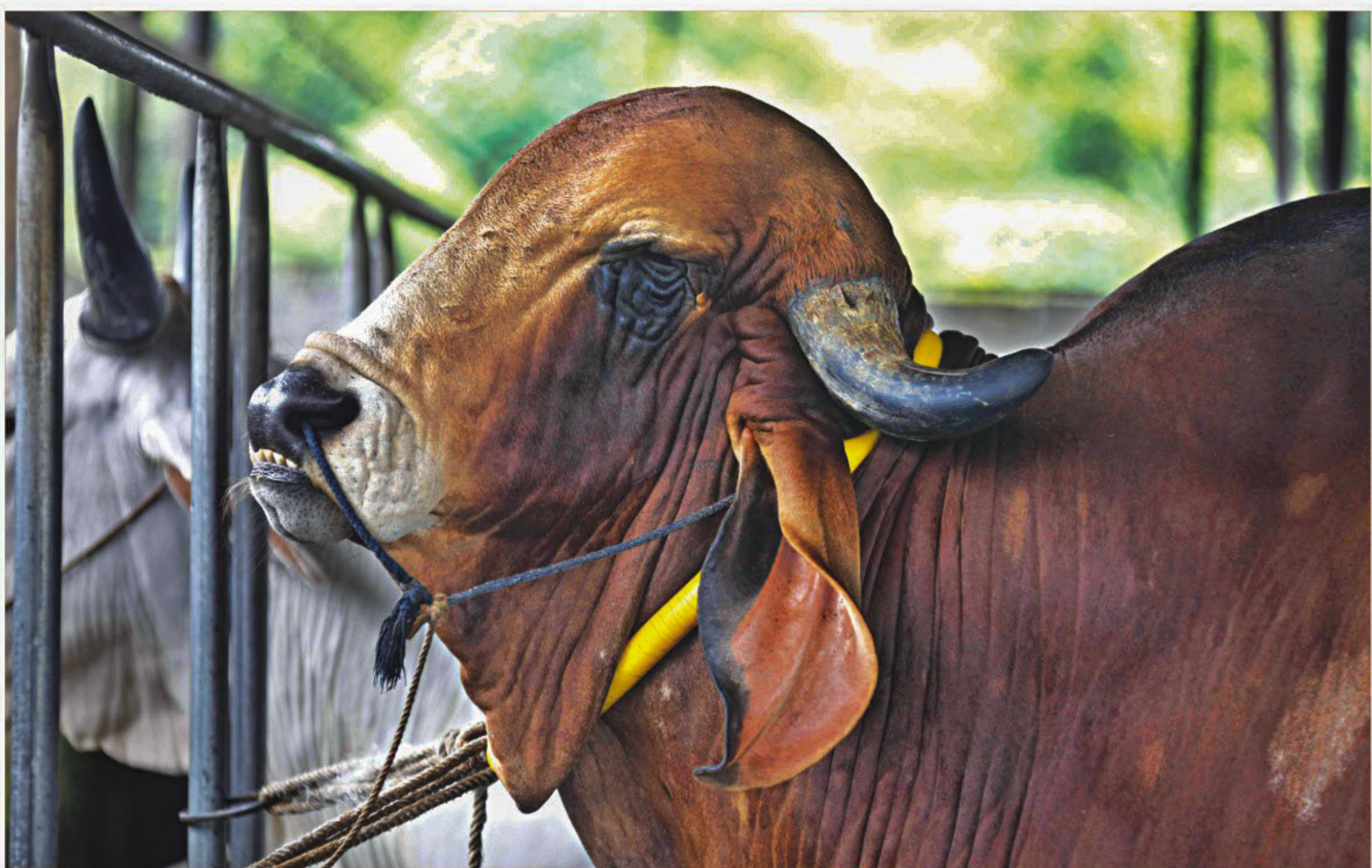
A cow at a cattle farm at Mohammadpur in the capital where livestock go through a fattening regime ahead of Eid. Some farms claim that they fatten cows in an "natural" way but most farms overdose cattle with vitamins and steroids available in the market.