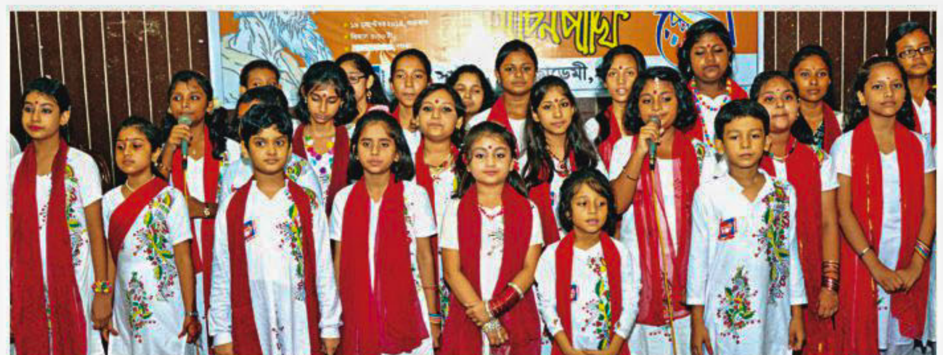
Artistes perform at the programme.