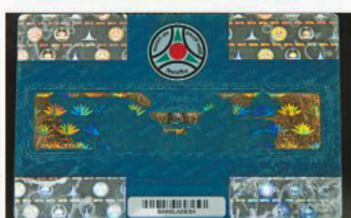
Examples of the RFID tags, top, and new number plates.