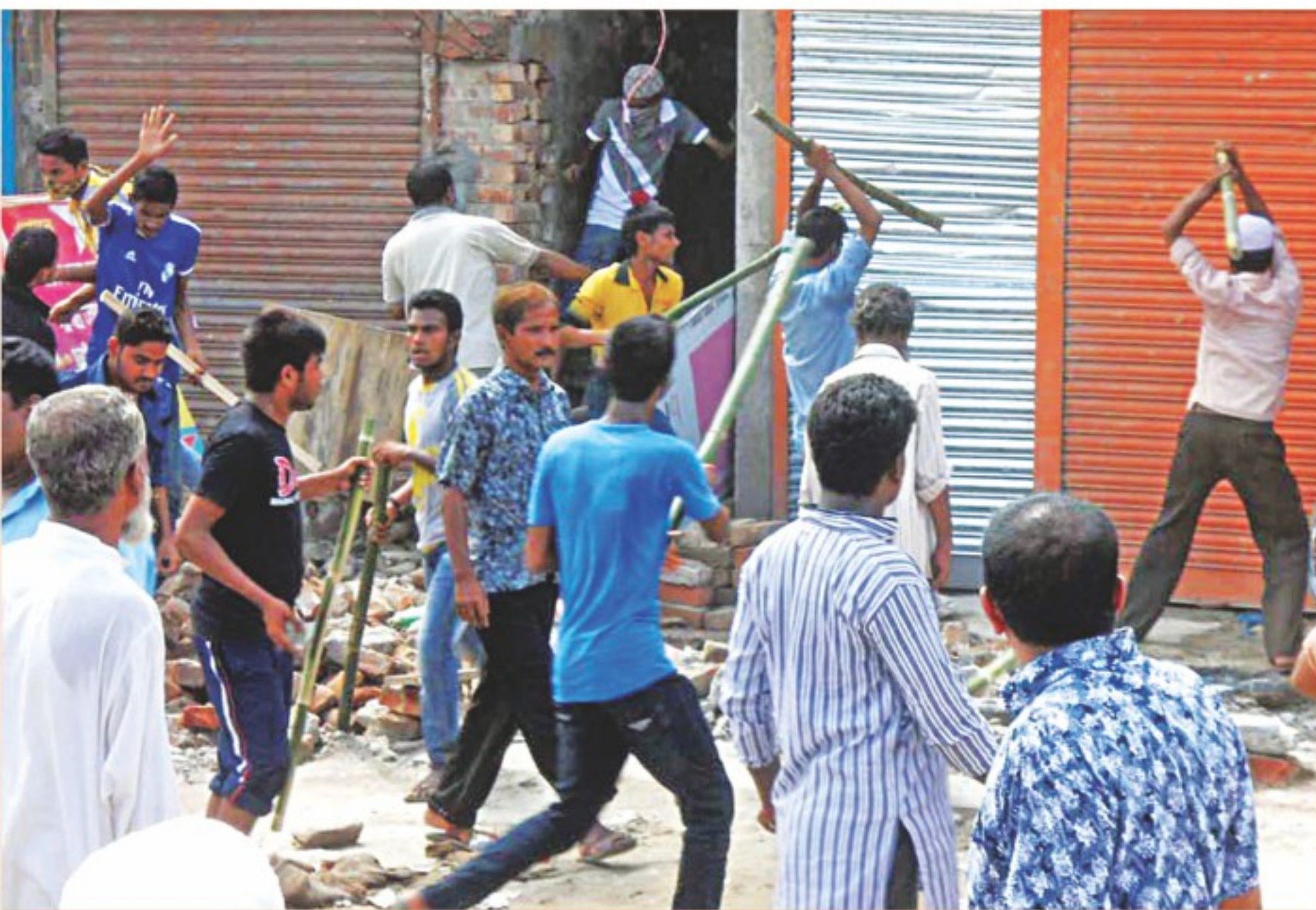
A Jatiya Party faction loyal to party chief HM Ershad vandalising the office of the faction led by Ranga yesterday in Rangpur. Story on page 16.