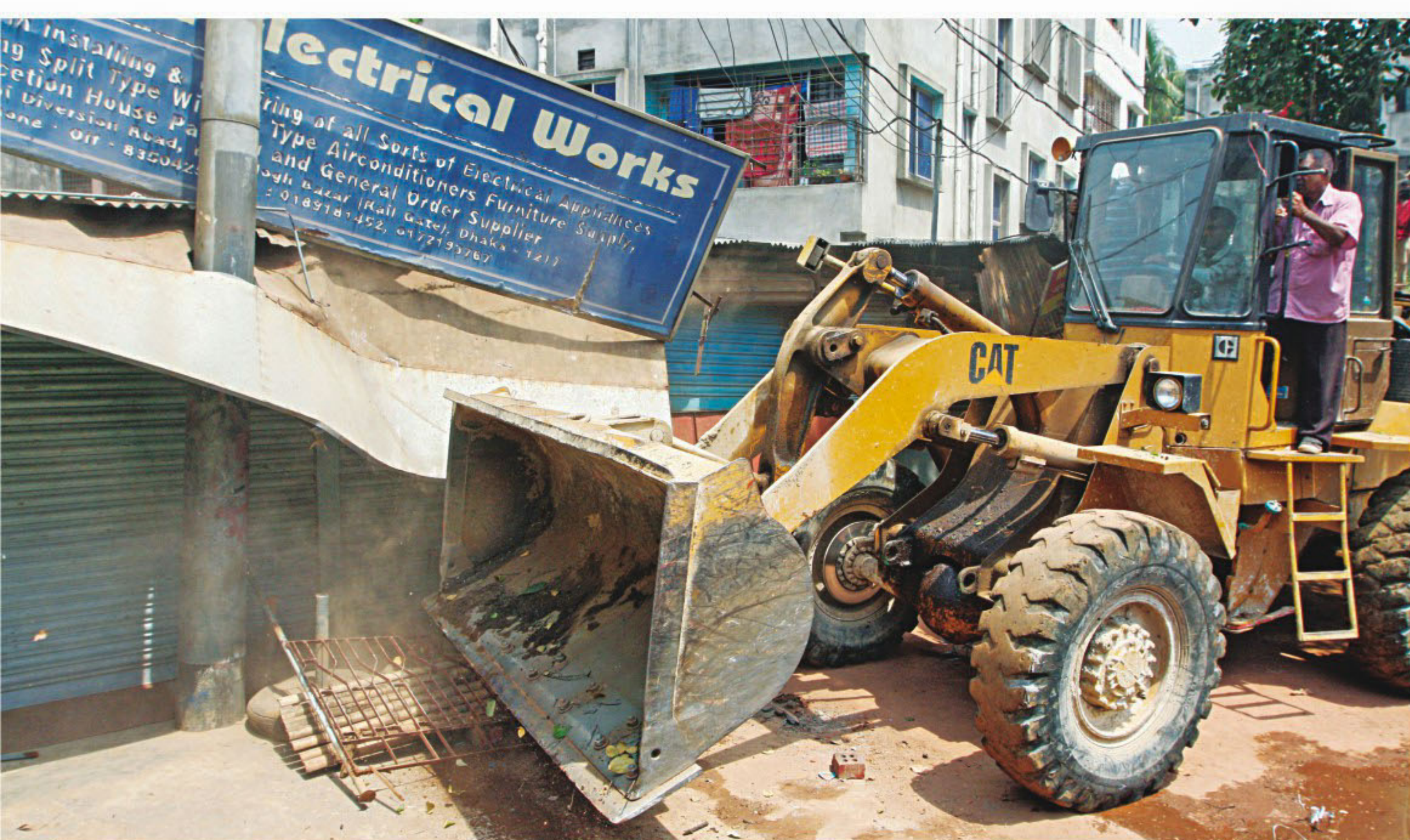
Bangladesh Railway destroying illegal structures built beside rail lines in Moghbazar area yesterday. The move comes after four people got killed by a train at an illegal fish market set up on the train lines in Karwan Bazar on Thursday.