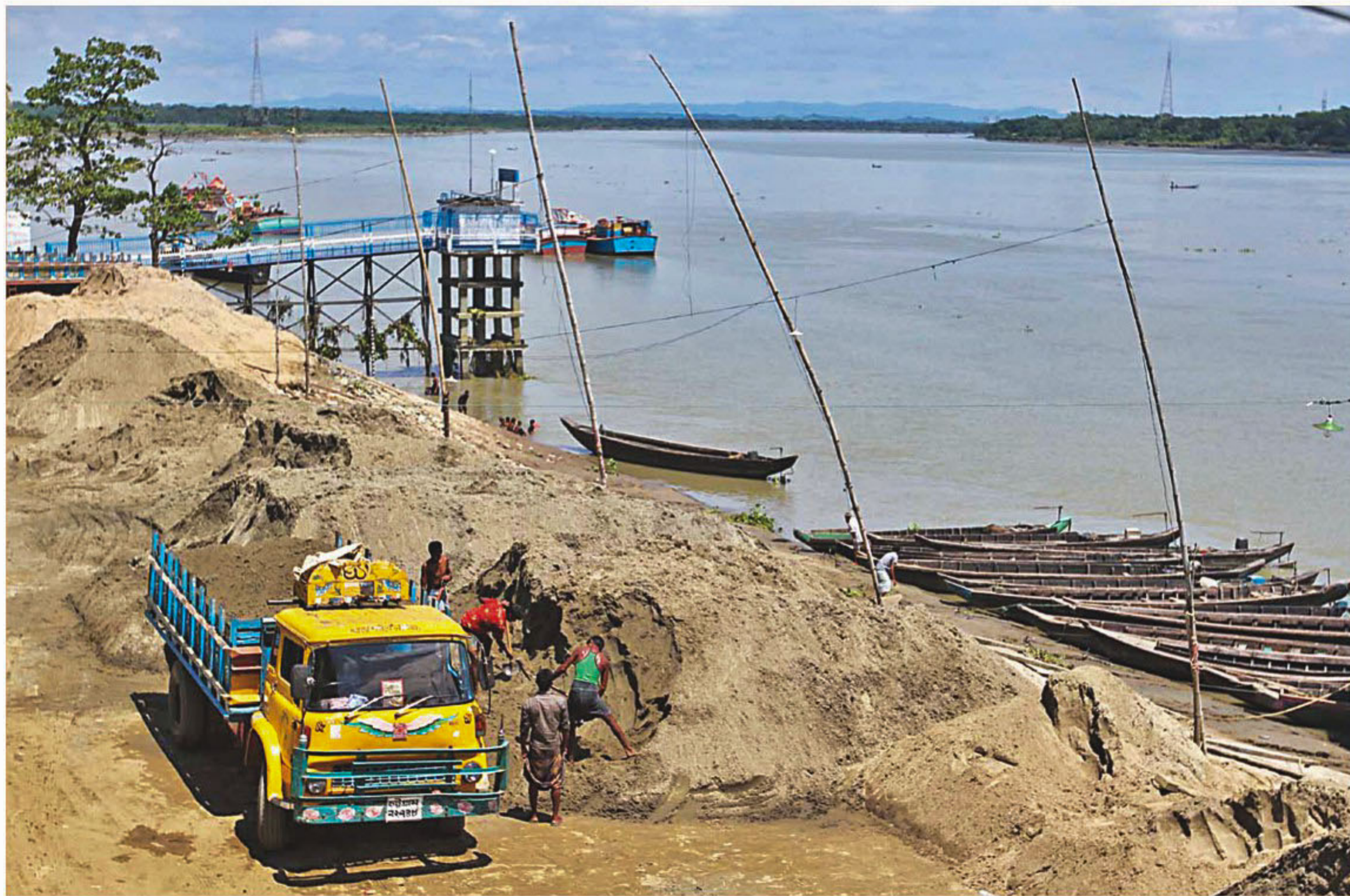
Illegal sand trading going on the shore of the Karnaphuli River, the lifeline of Chittagong city. Sand extraction in an unplanned and unscientific way is responsible for the erosion of banks and damage to the river floor. The photo was taken at Kalurghat yesterday.