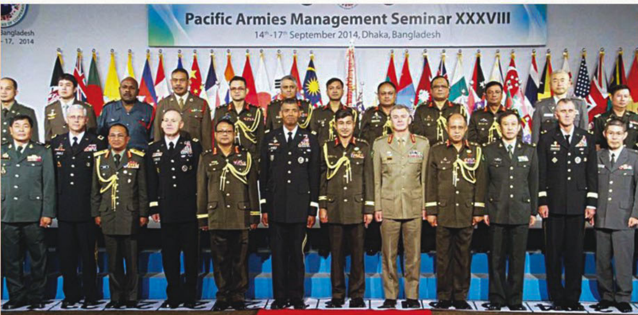
Chiefs and top officials of the armies from around 25 Asia-Pacific and Indian Ocean countries on the inaugural day of the four-day 38th Pacific Armies Management Seminar at Radisson Hotel in the capital yesterday.