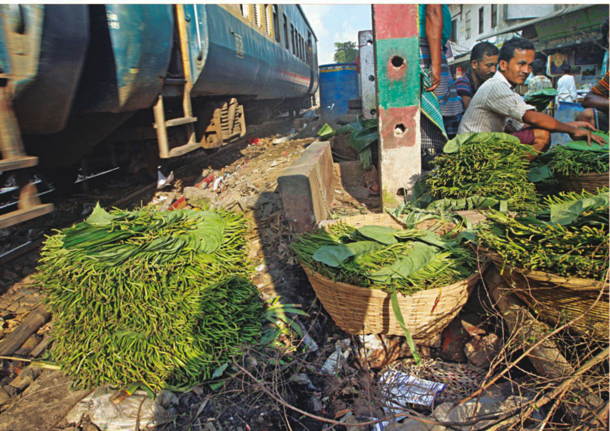
Left , a betel leaf trader returns to the rail tracks with a train whooshing by in the capital's Malibagh yesterday, right after the railway authorities knocked down about 350 makeshift shops to remove illegal market along the rail line from Khilgaon to Malibagh. Right , the railway authorities demolishing tin-shed structures of a kitchen market along the rail tracks in Chittagong's No-2 gate area.