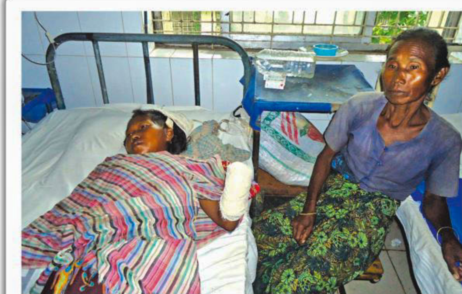
A mother of three and the breadwinner of her family in hospital bed at Bandarban. Her husband, unemployed by choice, cut off her hand from the wrist because she refused to go to work and bring him money.