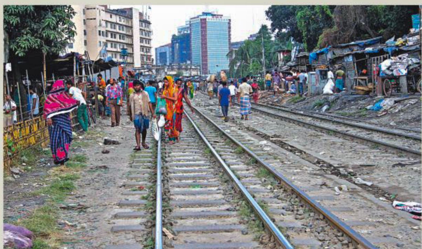
Bangladesh Railway Police dismantled and destroyed illegal structures beside the rail lines at Karwan Bazar yesterday, a day after four people got crushed to death by a train at an illegal market set up there. Top right , a train approaches from behind a blind curve. People still walk on the lines, bottom , and the illegal market is now gone.