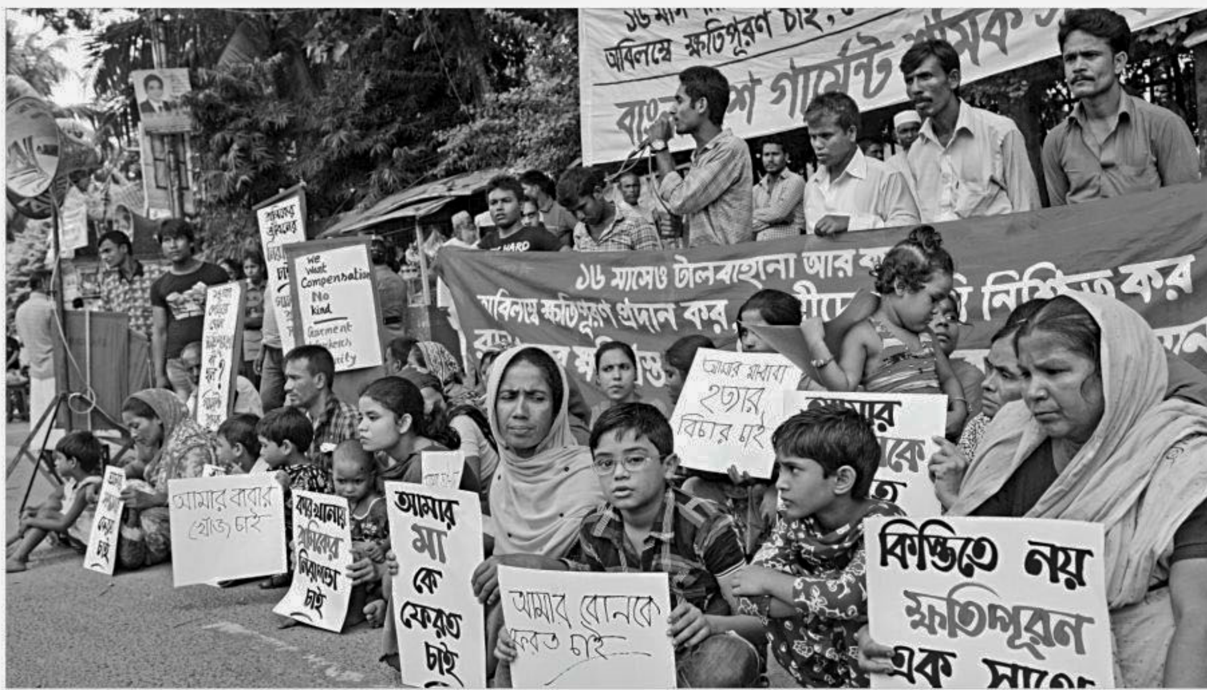
Relatives of garment workers who were killed or went missing in the Rana Plaza collapse gathered under the banner "Bangladesh Garment Workers' Solidarity" in front of Jatiya Press Club in the capital yesterday demanding compensation. The nine-storey Rana Plaza collapsed on April 24 last year leaving 1,136 people dead and hundreds injured.