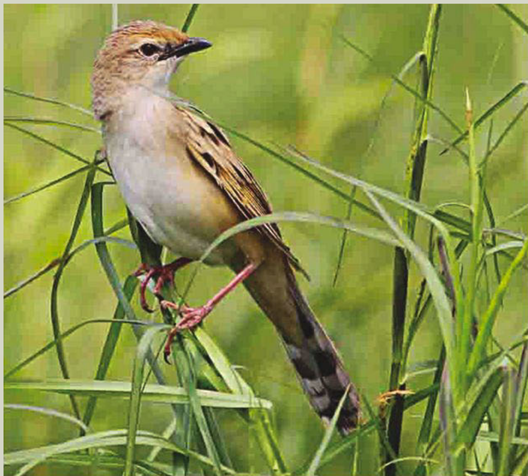
Bristled Grassbird at Tanguar Haor.