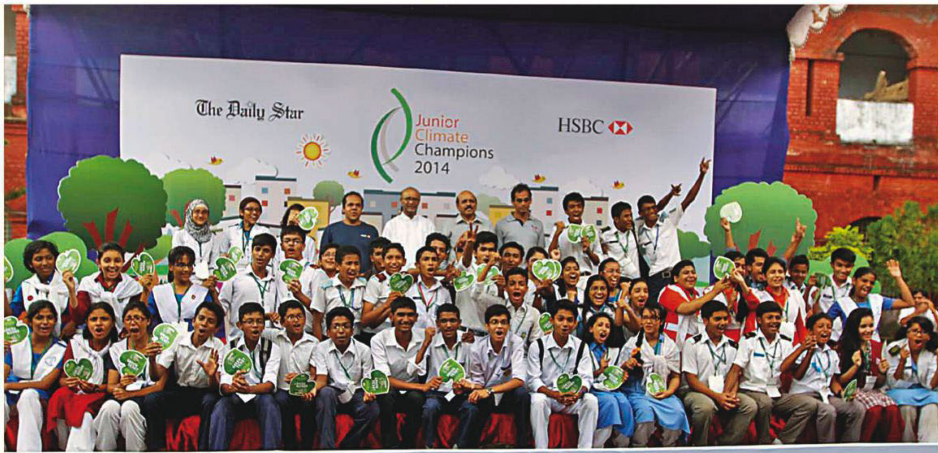
Winners with guests at the award ceremony of the Chittagong divisional round of "Junior Climate Champions 2014" at Chittagong Collegiate School in the port city yesterday.