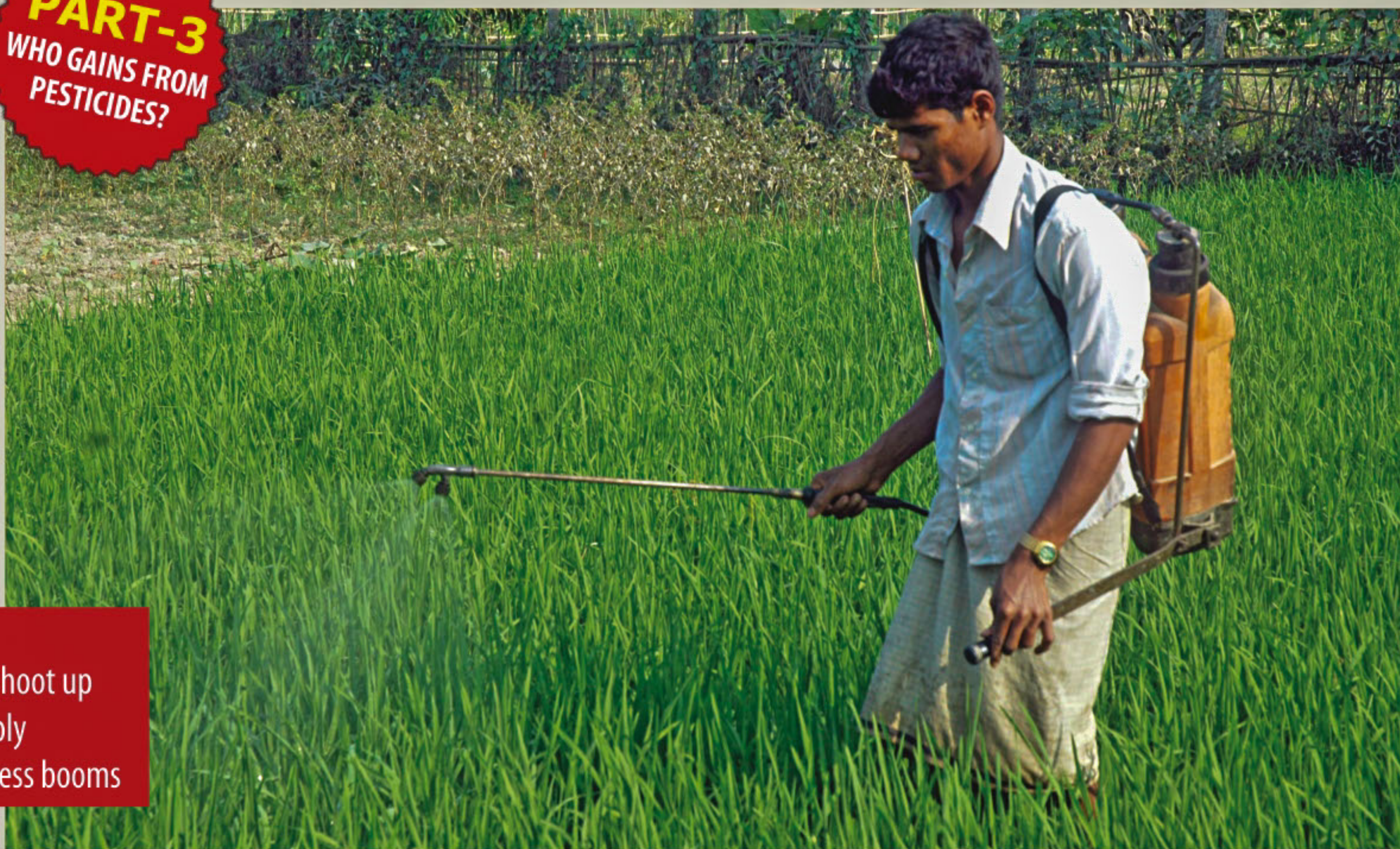
A farmer spraying pesticide in a paddy field.