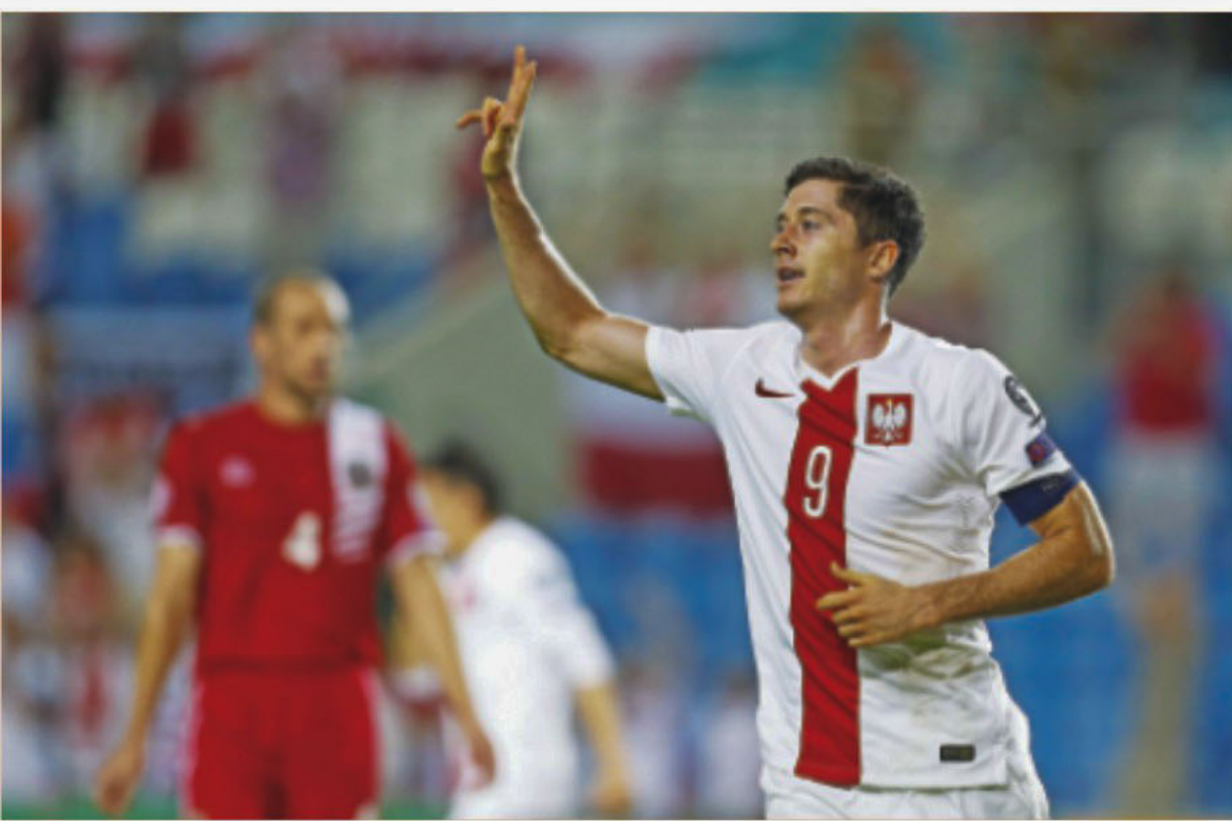
Poland striker Robert Lewandowski celebrates one of his four goals against Gibraltar during their Euro 2016 qualifier in Faro on Sunday.

"Now I would make an official declaration definitely in September (to stand)... when we have the executive committee."