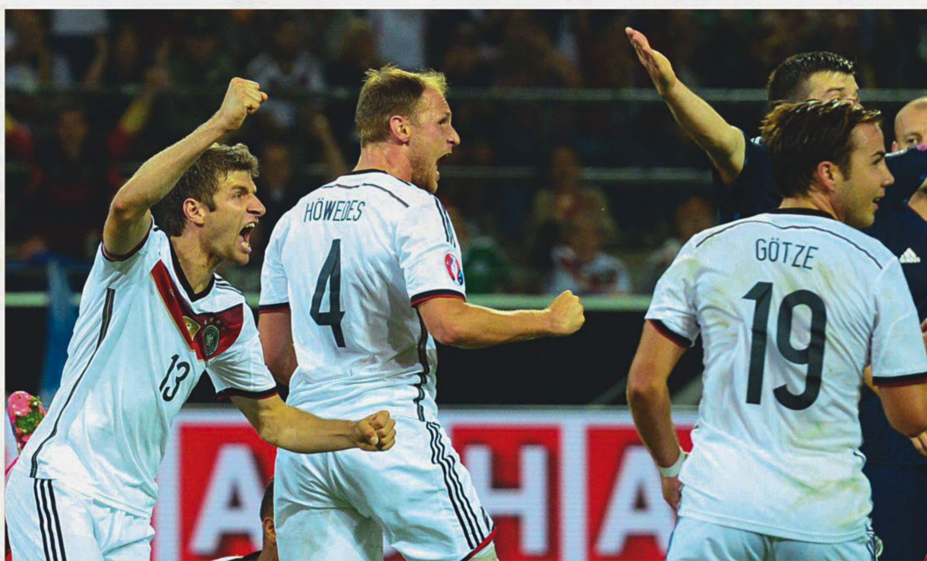
Germany forward Thomas Mueller (L) celebrates his second goal with teammates during their Euro 2016 qualifier against Scotland in Dortmund on Sunday.

And there was a real warning for Germany three minutes after the restart when Naismith skipped past two players inside the box only to see his shot shave the post.