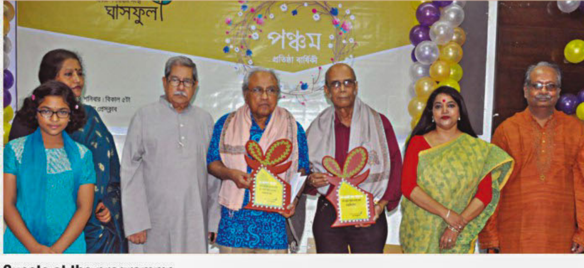
Guests at the programme.