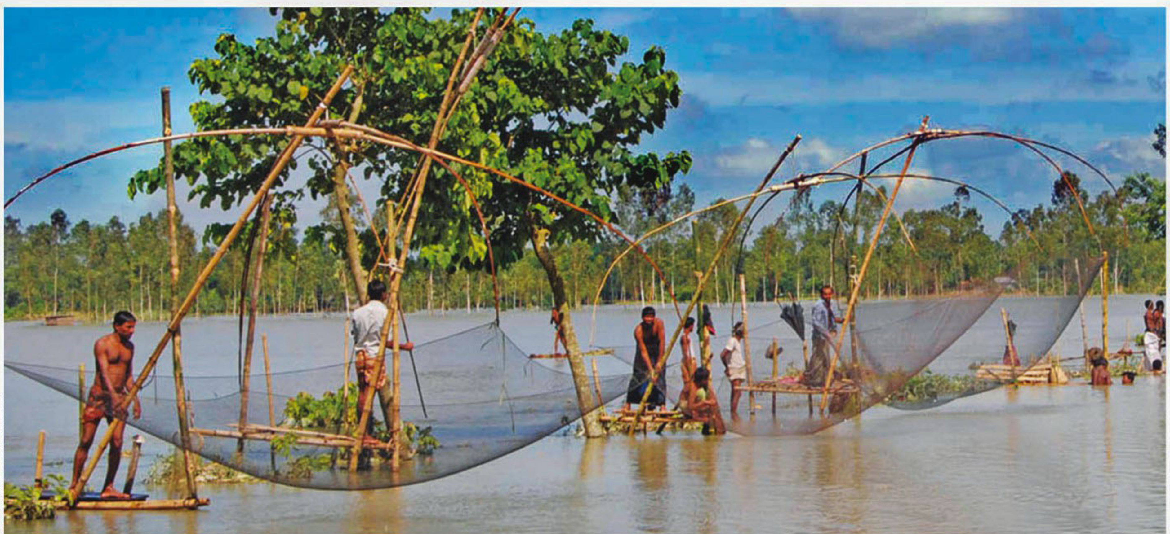
People try to catch fish in Arkatia of Dhunat in Bogra yesterday as the flooding there released fish from fish farms of the area.