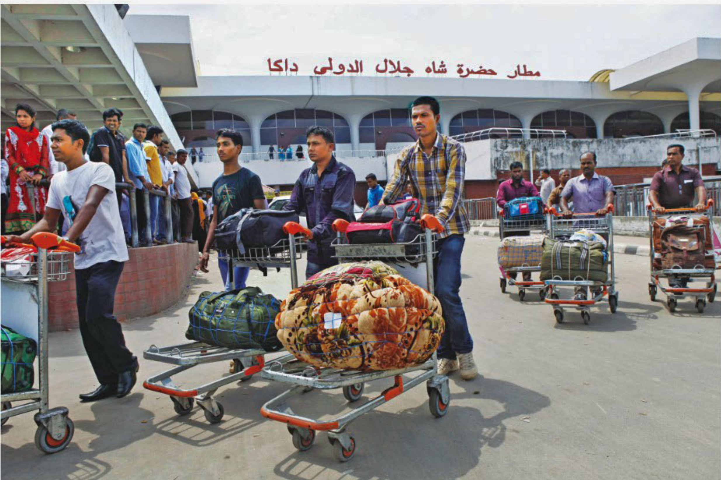
Bangladeshi workers arrive at Shahjalal International Airport yesterday. They were paid less than a quarter of their promised salary in Sudan.