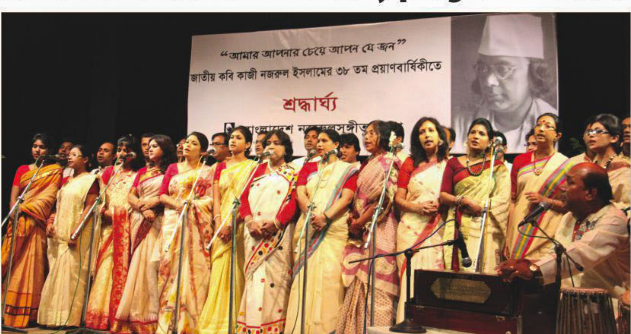
Artistes sing a choral song.