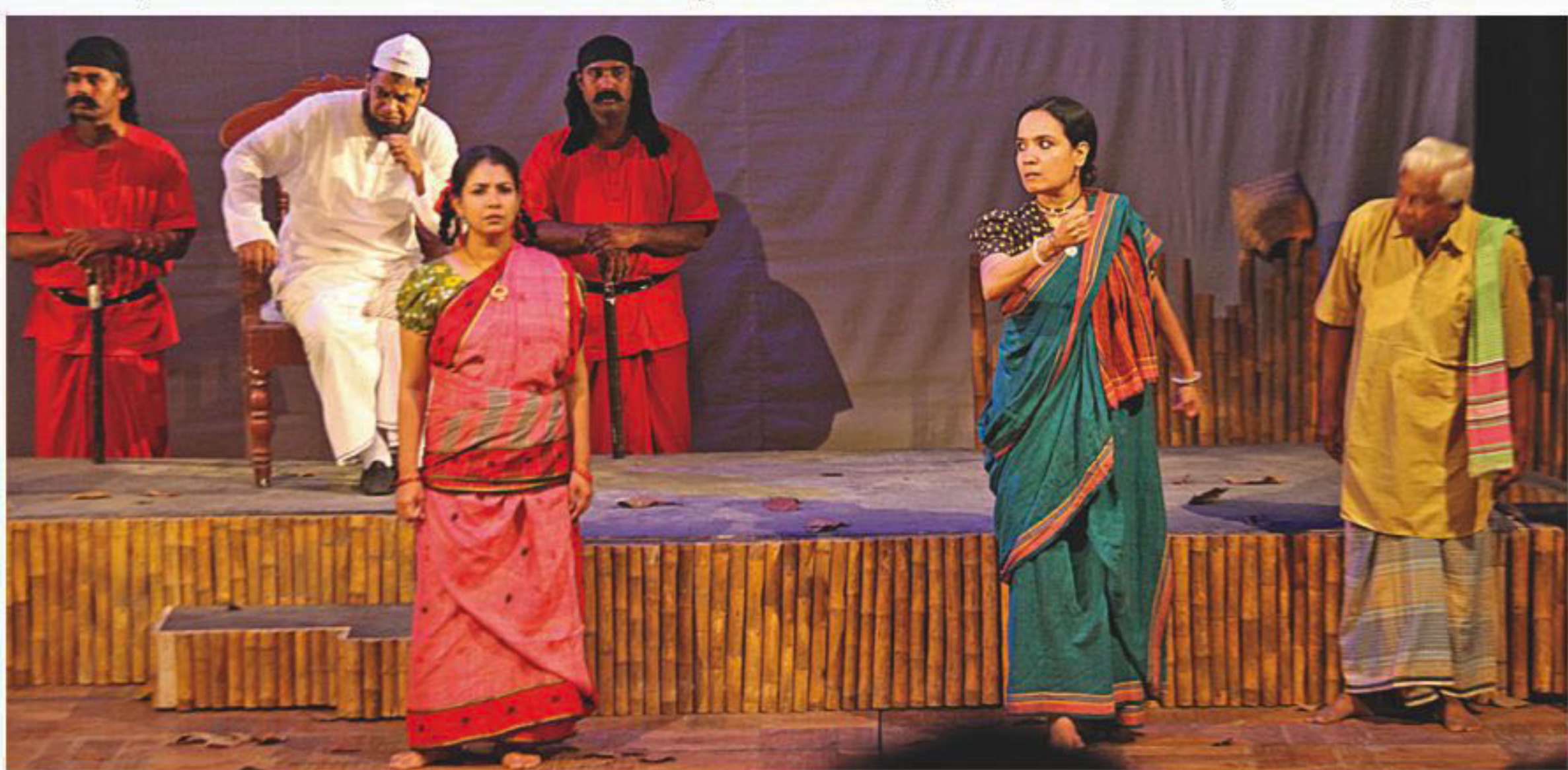
A scene from Payer Awaj Pawa Jaye.