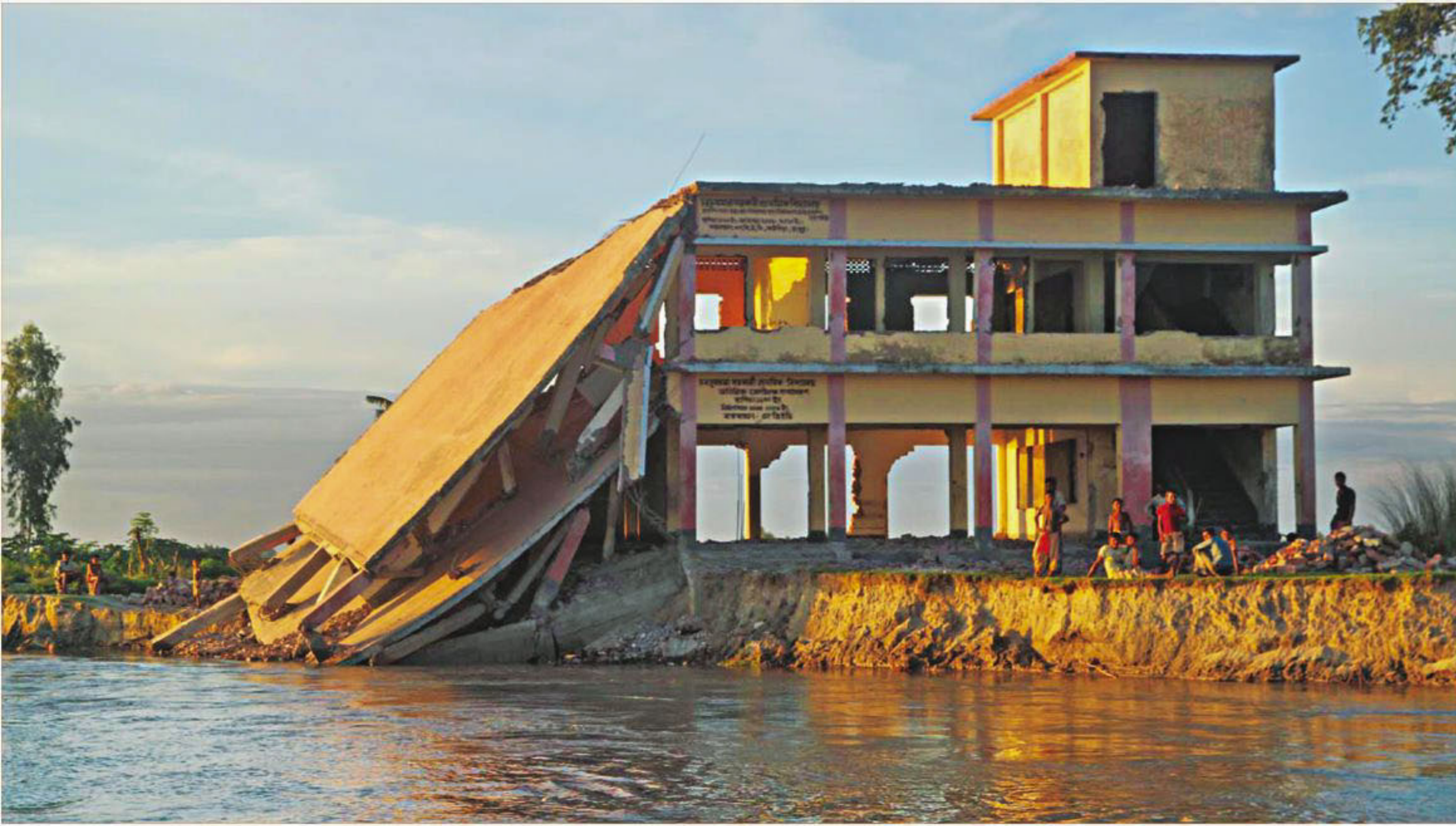
The Teesta devours a school at Dhusmara Char in Kaunia of Rangpur jeopardising the dreams of several hundred students. The partially collapsed school had to be demolished. The photo was taken in July.