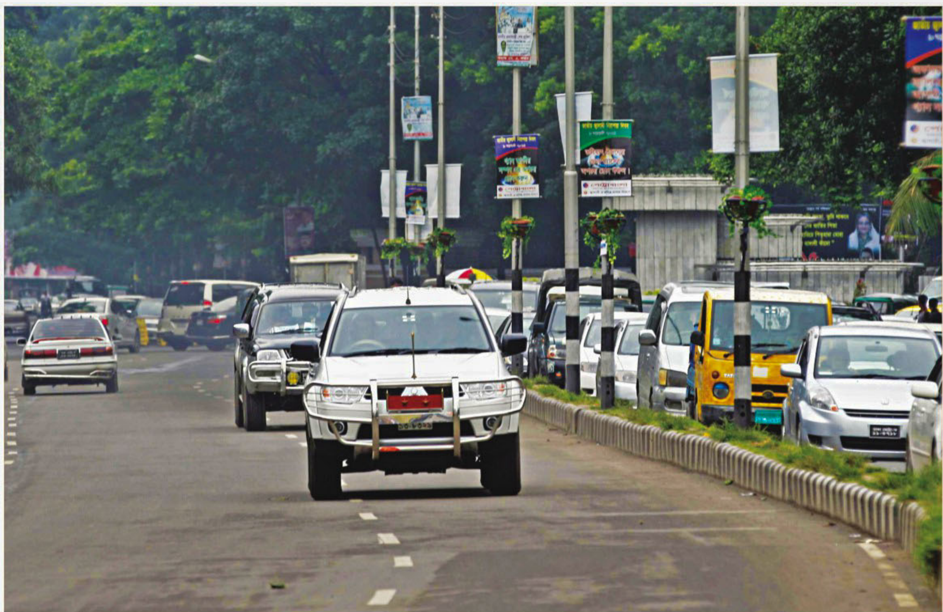
A sport utility vehicle of a high official dangerously driving on the fast lane of the wrong side of the road in front of Ruposhi Bangla Hotel in the capital while law-abiding citizens wait at the set of traffic lights. The photo was taken recently.