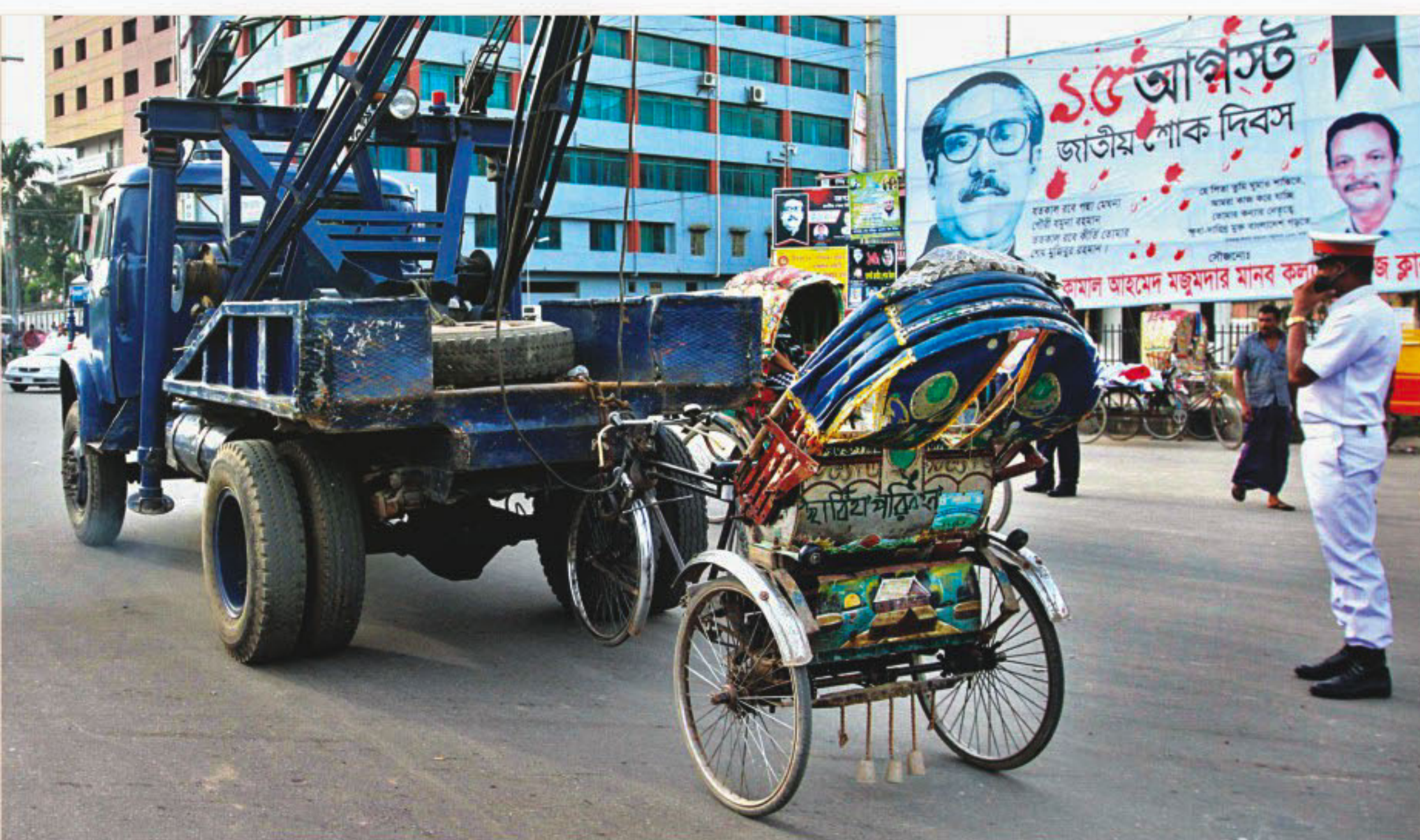
Burning diesel, a tow truck takes away an illegal rickshaw to Agargaon from Bhashantek, Mirpur, yesterday. It amused many on the 8km journey, who felt it was an overkill.

JS TO PASS BILL IN CURRENT SESSION -- PAGE 16