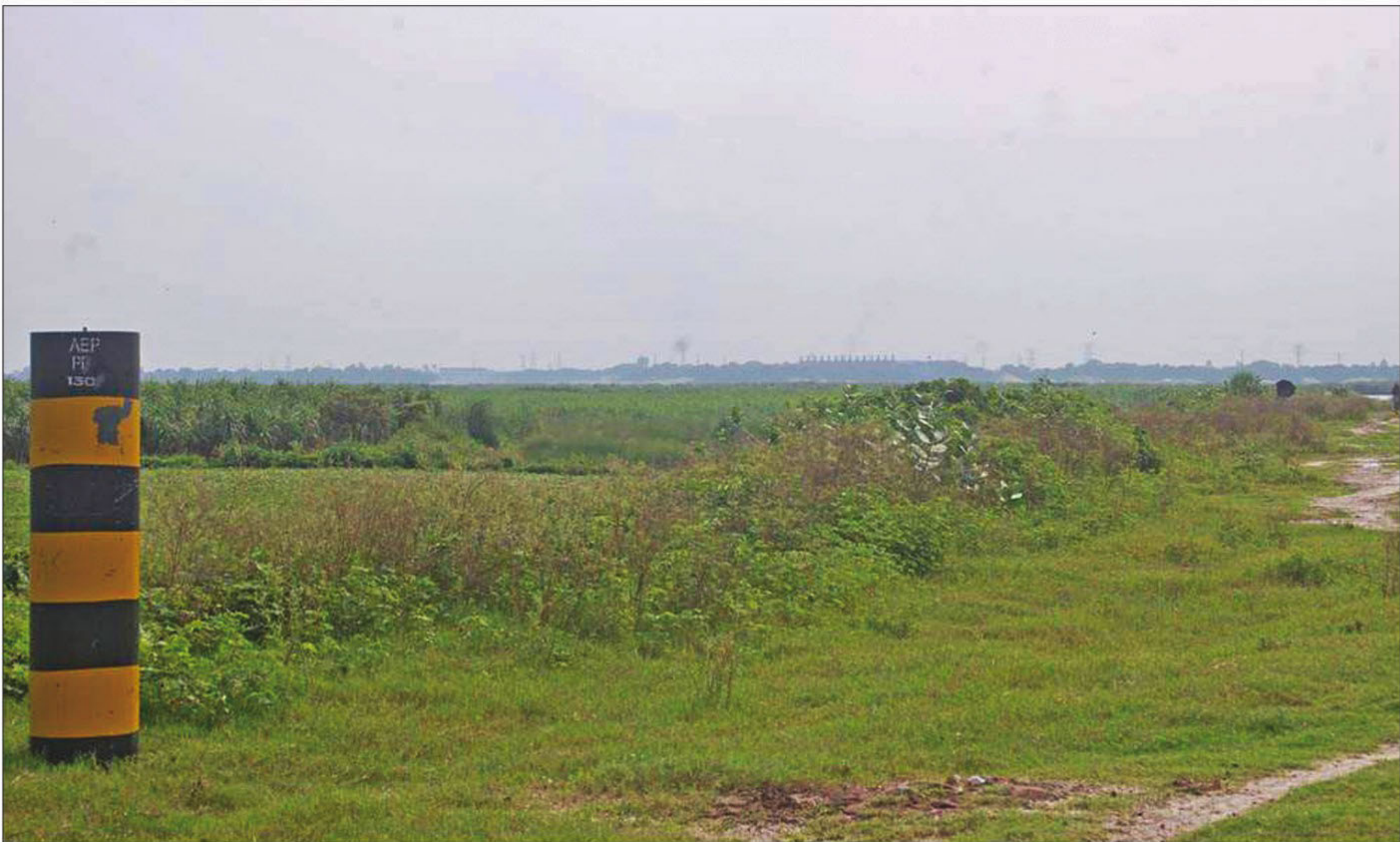
The pillar on the left marks the boundary of Rooppur nuclear power plant project and the river Padma was supposed to be close by. But over the years the river has moved a distance and the plant site now is 2.5km away from the flow of the river.