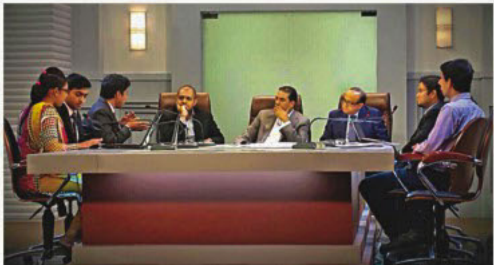
Participants with the judges on the show.