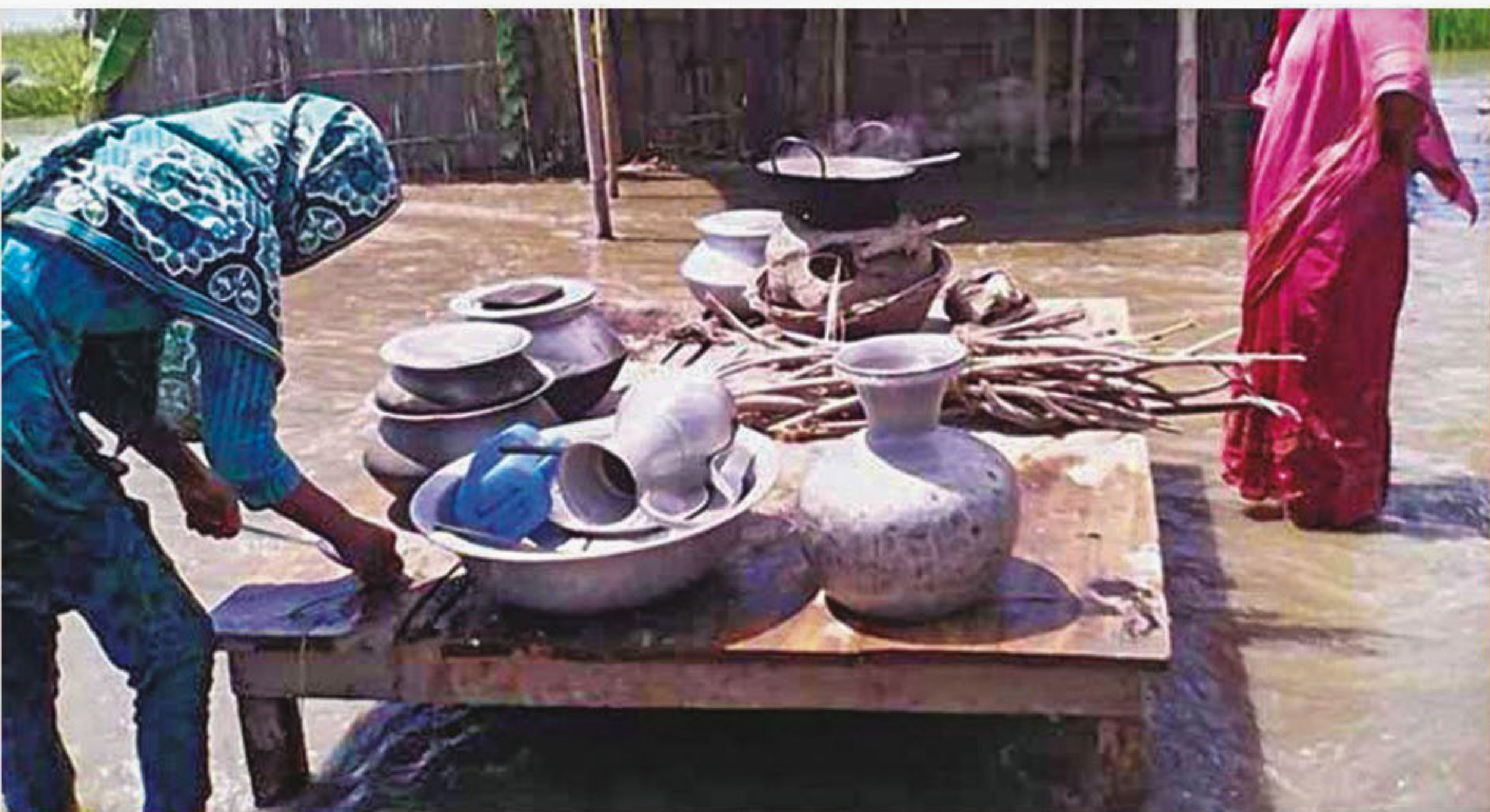
Two women cook in their front yard in ankle-deep water as the flooding and erosion by the Jamuna continue to devastate the Phulchhari upazila of Gaibandha. The photo was taken yesterday at Paglar Char.