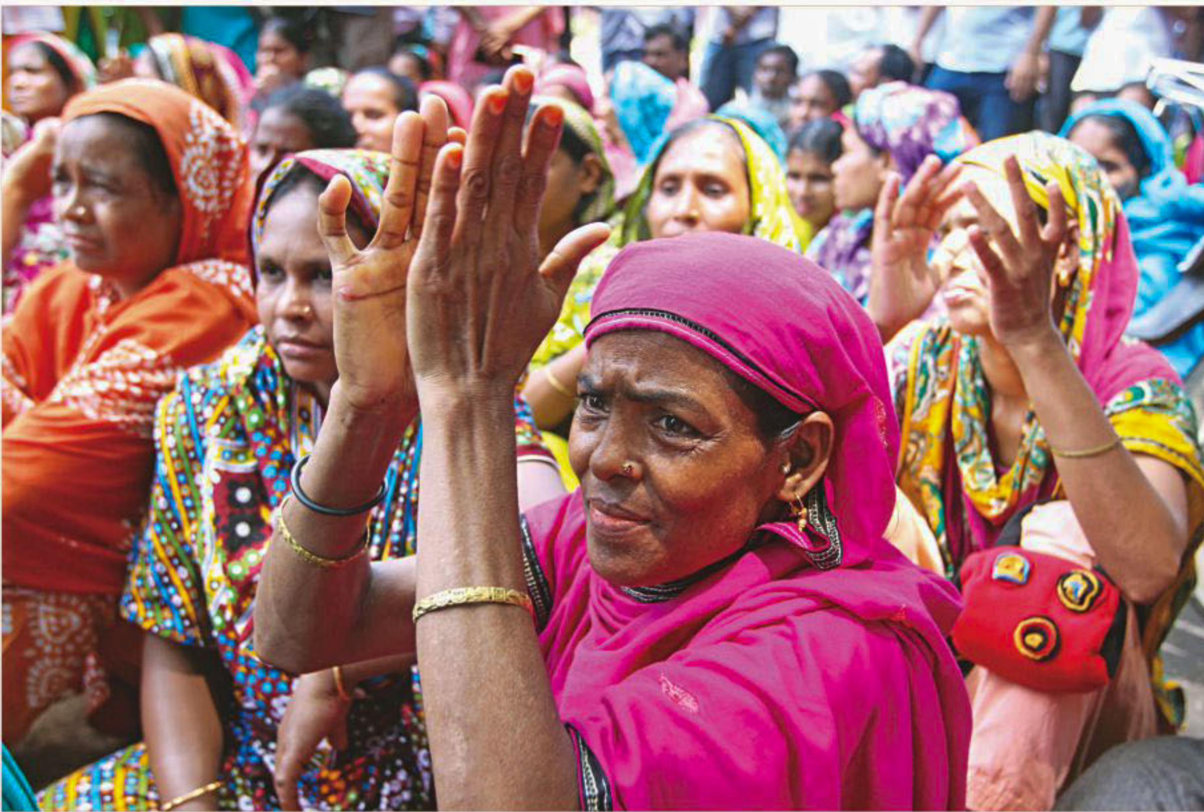
Garment workers under the banner of Tuba Group's Sramik Sangram Committee gather before Jatiya Press Club in the capital yesterday demanding that the government take control of the company and restart the factories and also pay arrears to the workers according to labour law.