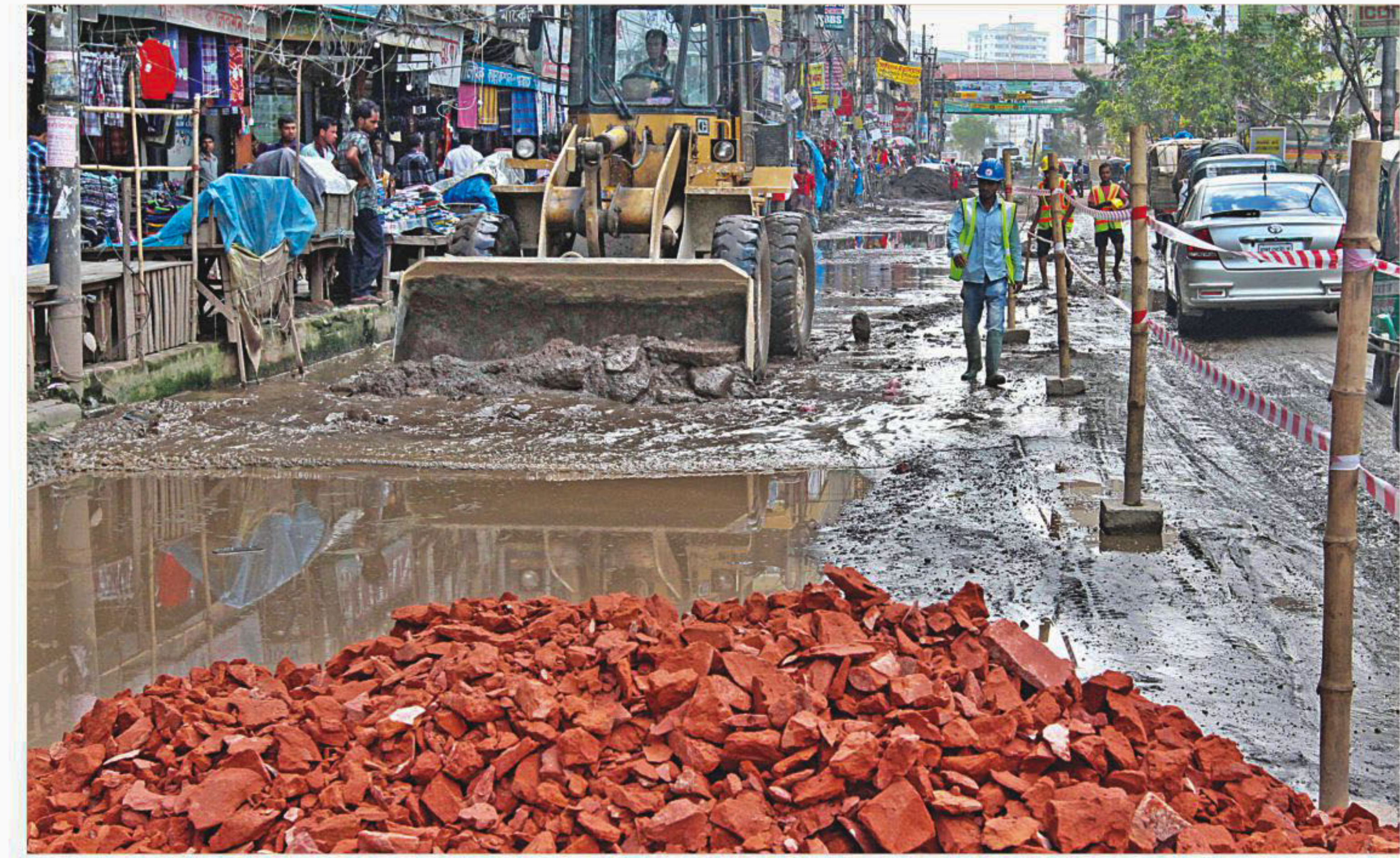
Temporary renovation work underway on the Malibagh-Mouchak road in the capital yesterday, which is battered heavily because of a soil test there several months ago for the construction of Moghbazar flyover. The authorities excavated narrow trenches for the test but did not properly fill those with earth. In the monsoon, the road has turned into a nightmare. The authorities undertook the stopgap measure Thursday night after repeated media coverage of the public sufferings. However, residents of the area are skeptic about how long the road would remain in good shape.