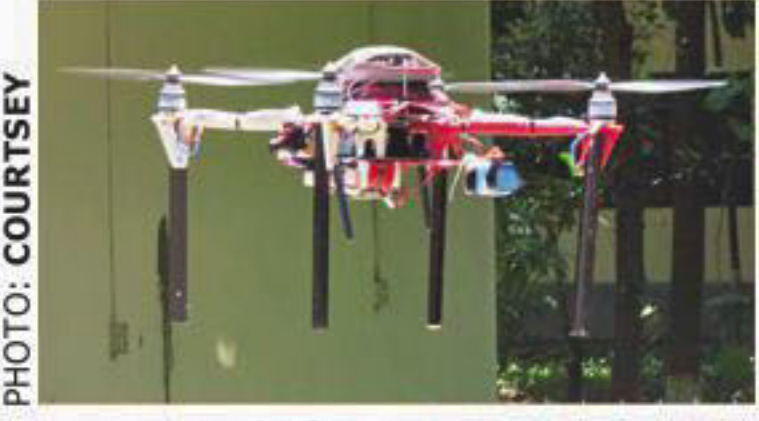
The drone in flight.