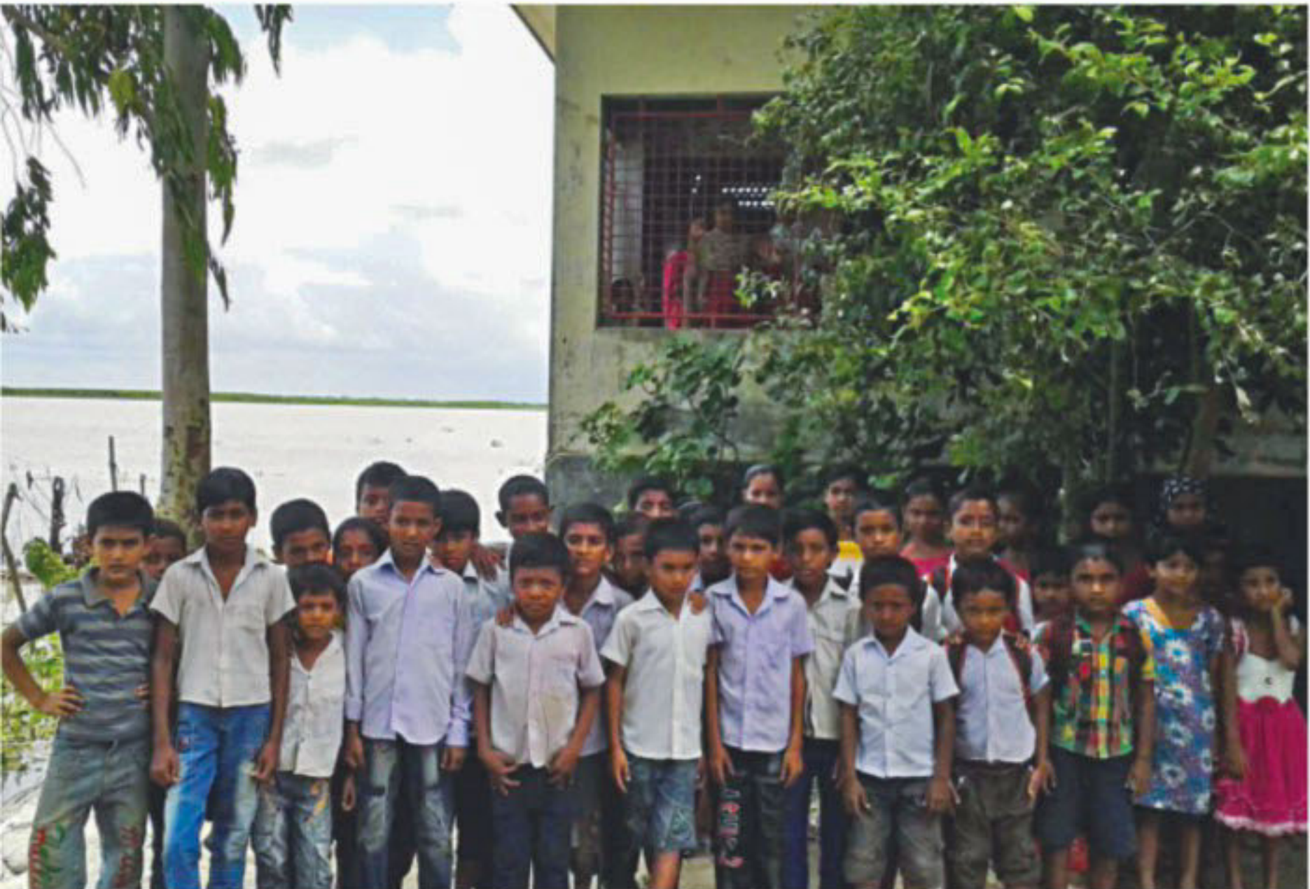
Students of Borail Government Primary School in Tongibari upazila under Munshiganj district give a grim look as their classes are stopped amid risk of devouring the schoolhouse anytime by the turbulent Padma. Right, Arial Kha engulfs portion of Baheratala Government Primary School in Shibchar uapzila under Madaripur district.