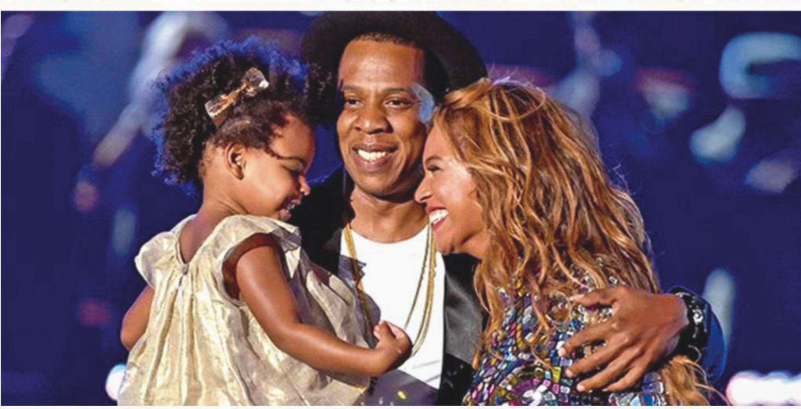
Jay-Z, Beyoncé and the adorable Blue Ivy on stage together produced one of the most memorable moments of VMA.