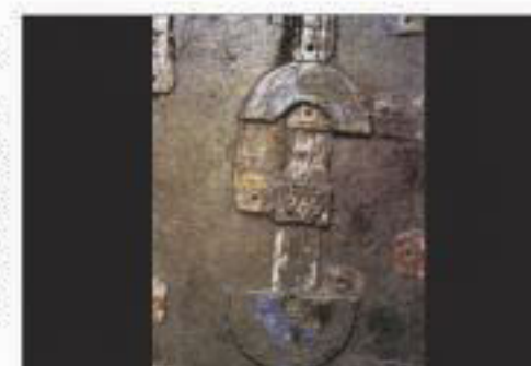
Photo Exhibition Images of Caring Men Venue: Dhaka Art Center Date: August 23-28 Time: 3pm-8pm