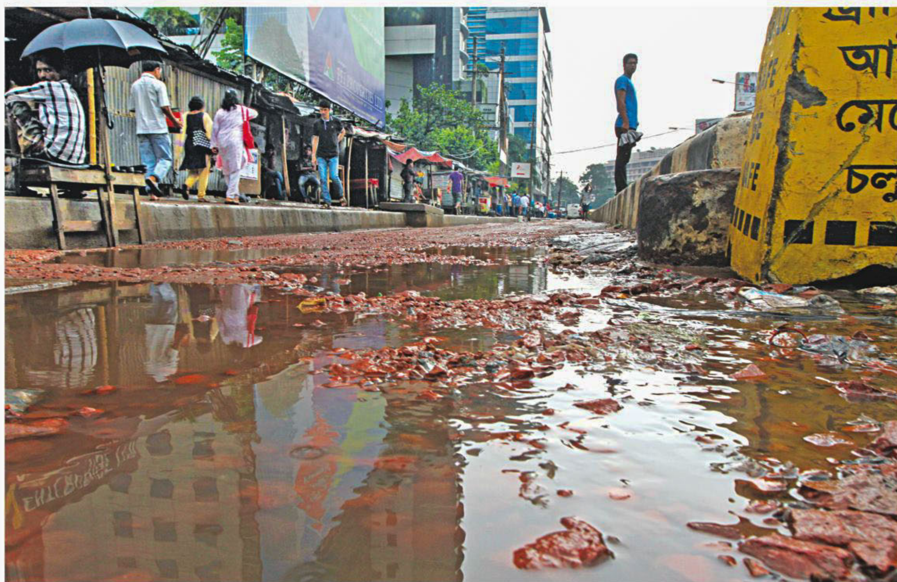
This lane on Panthapath which leads vehicles to Kazi Nazrul Islam Avenue has been in this sorry state for months as it was dug up for repairs underneath and not mended properly. The photo was taken near Bashundhara City shopping centre.