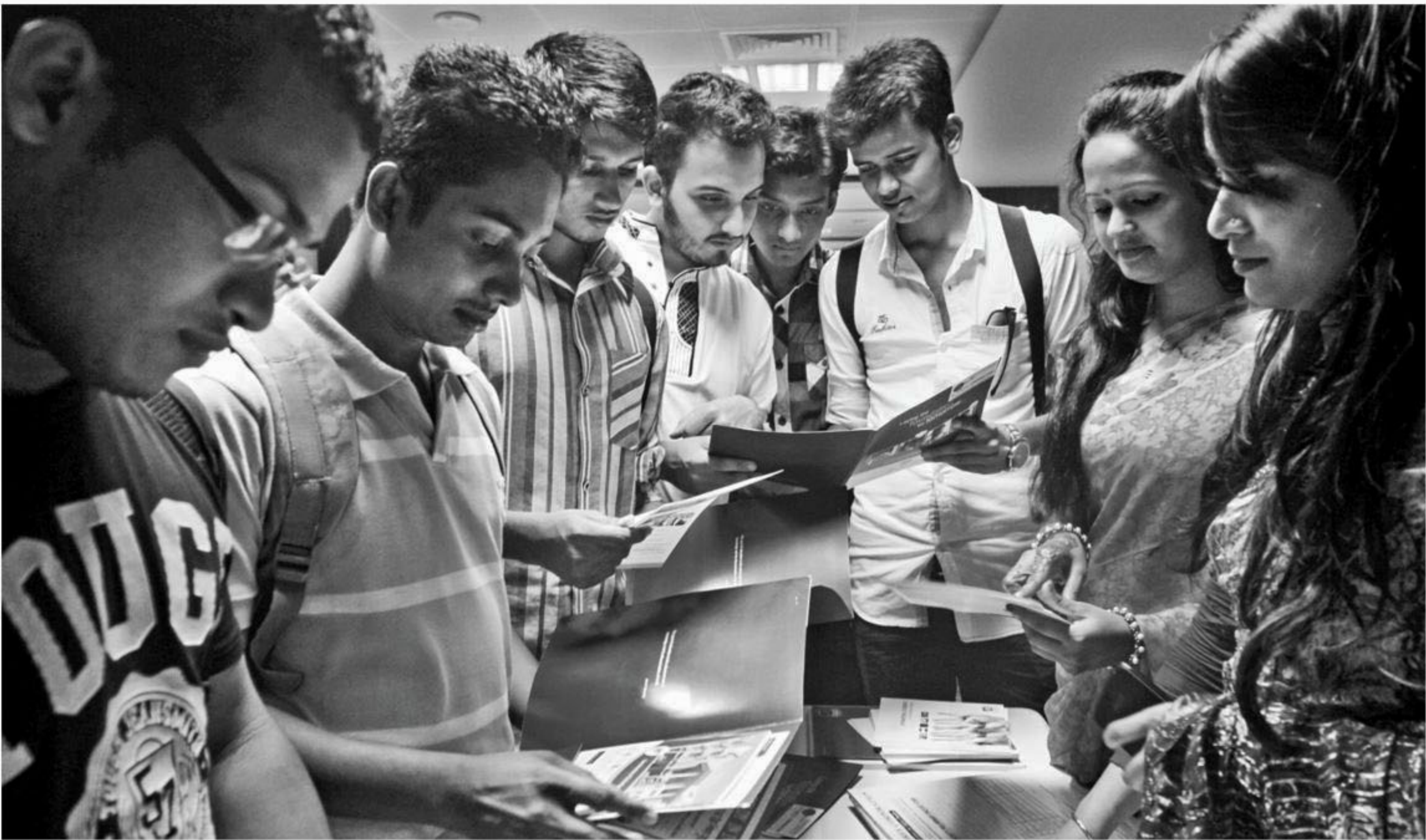
Students, willing to pursue graduate or post-graduate studies in eastern Indian colleges, go through brochures yesterday, on the first day of a two-day admission campaign, organised by R-Three Corporation, a consultancy firm, at The Daily Star Centre in the capital. On-the-spot admissions at the event will remain open till September 10.