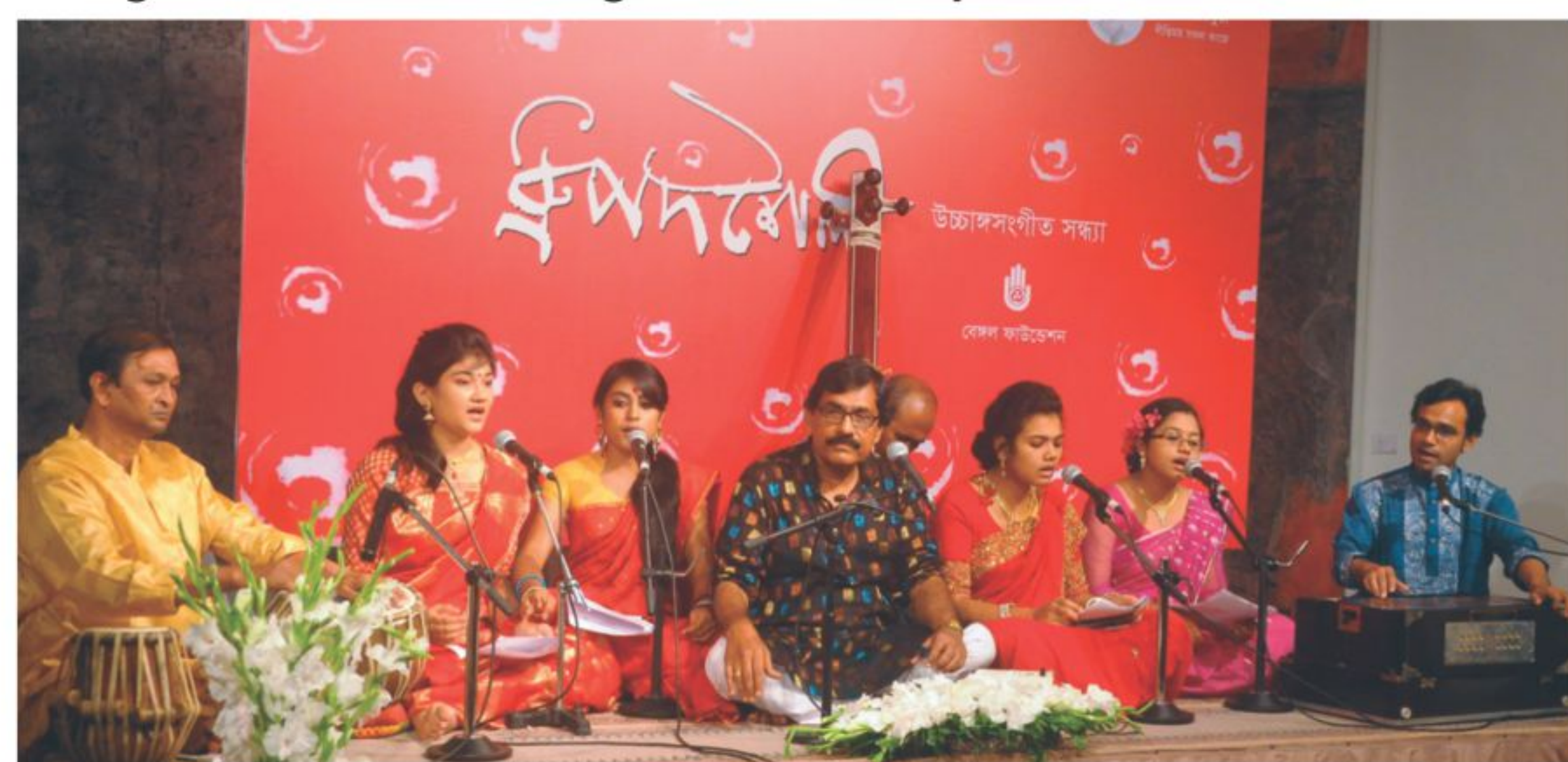
Artistes perform at the soiree.