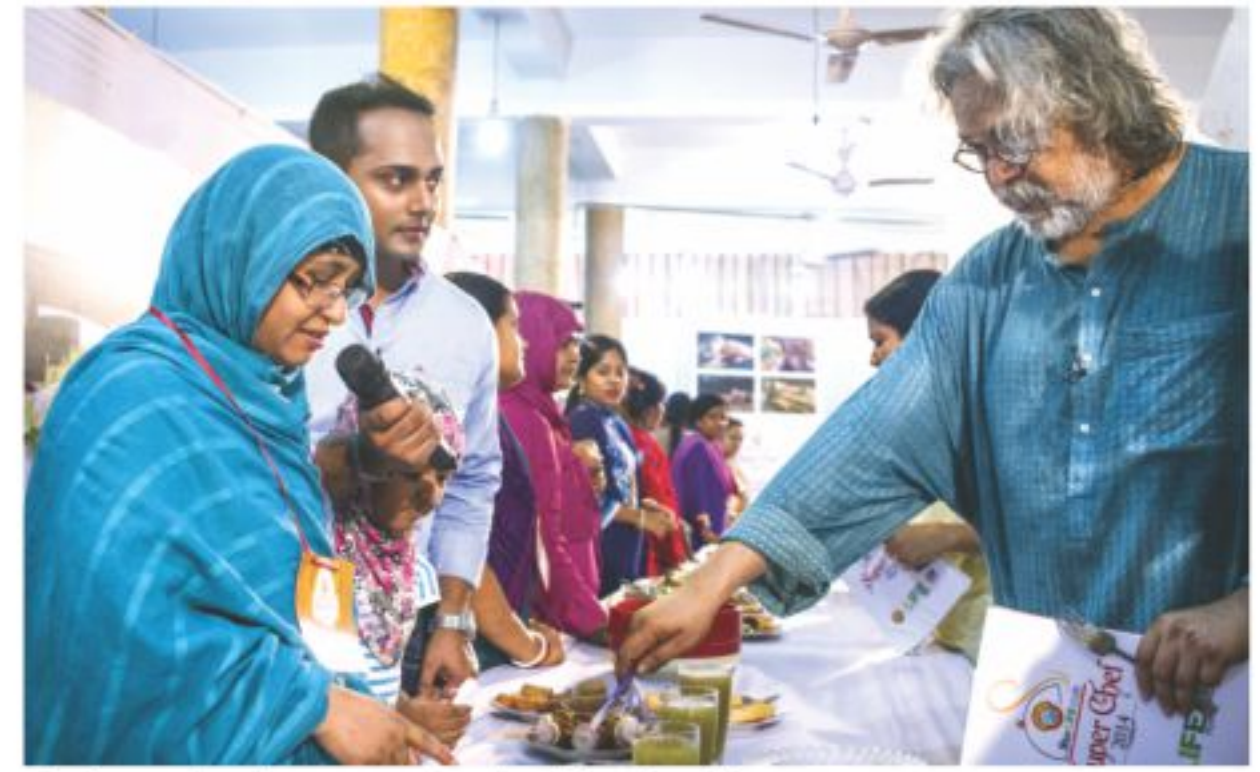
Judges taste a contestant's food.