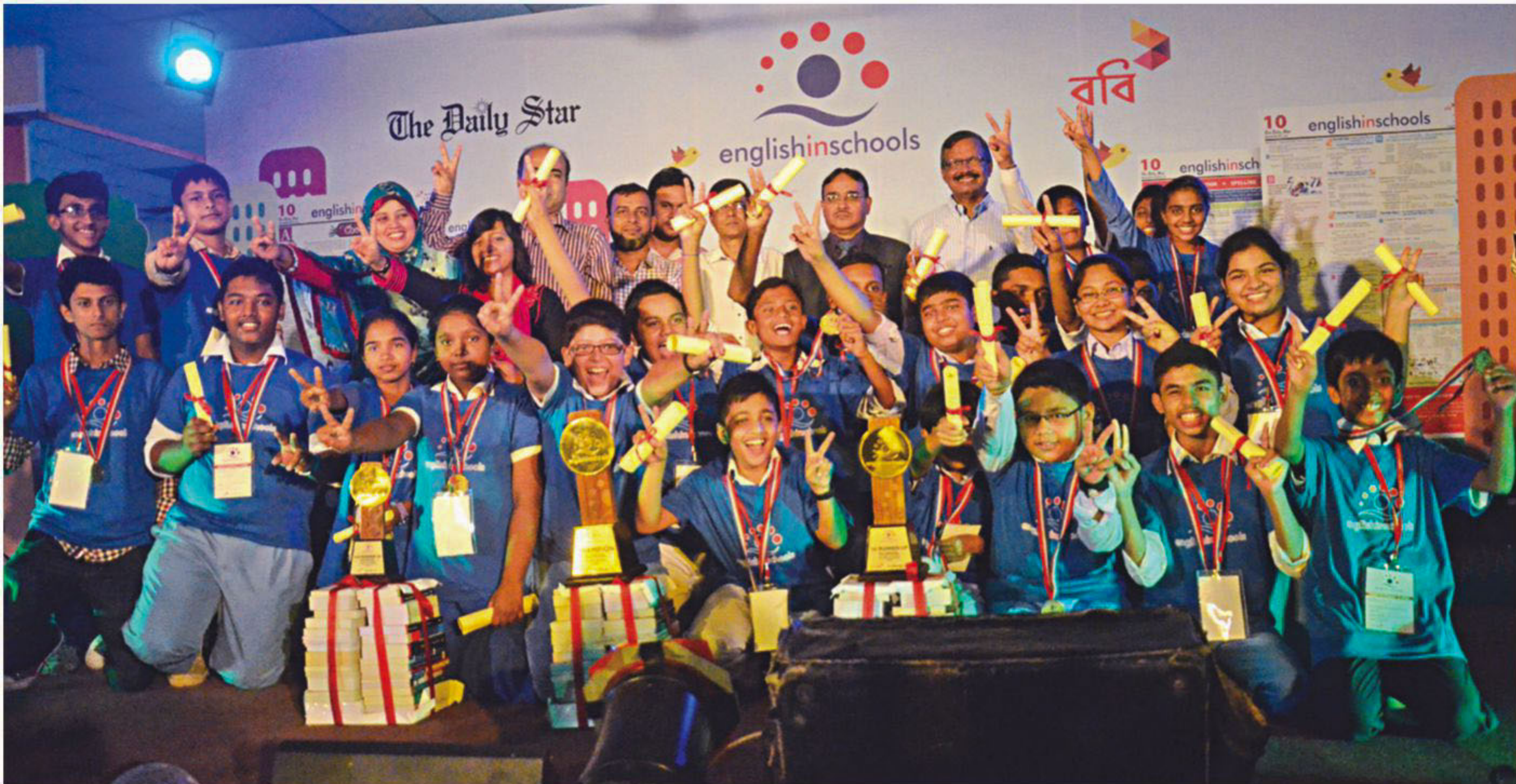
Students of winning schools and guests at the Sylhet divisional round of English in Schools, a joint programme of The Daily Star and Robi, held in Scholarshome School and College in Sylhet city yesterday.