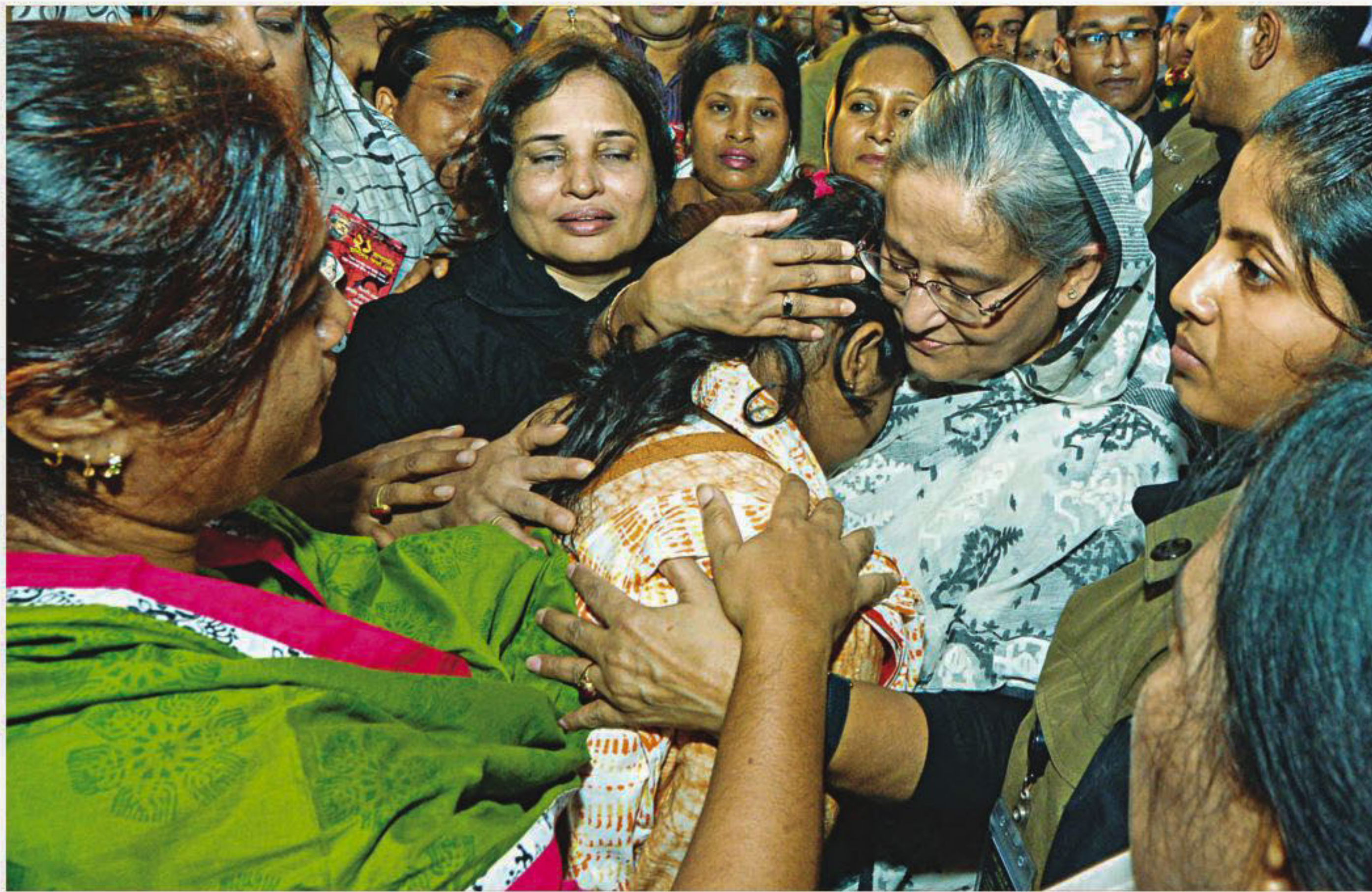
On the 10th anniversary of the August 21, 2004 grenade attack, Prime Minister Sheikh Hasina consoles a victim on Bangabandhu Avenue yesterday.