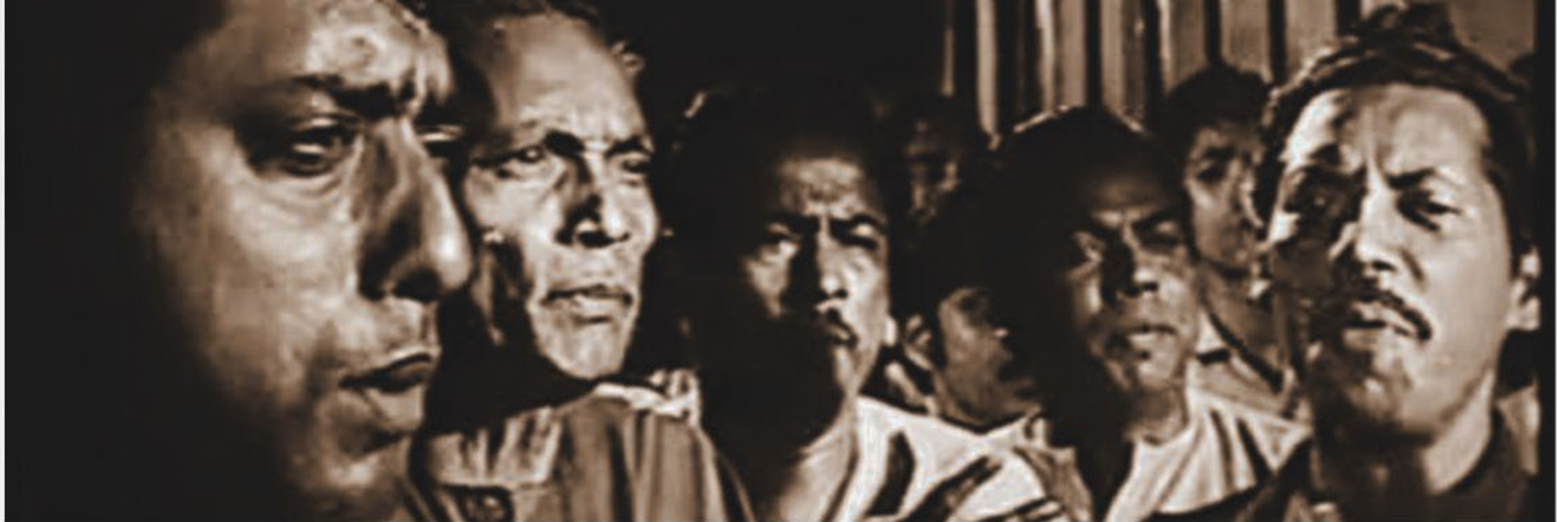
A scene from "Jibon Theke Neya".