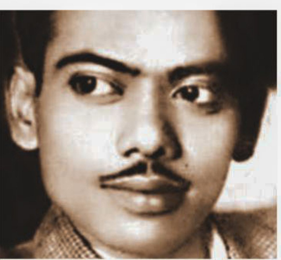
Mrittu" and "Trishna".

Apart from films, Zahir Raihan was also an accomplished writer. His publications include "Surjya Grahana", "Shesh Bikeler Meye", the epic "Hajar Bochor Dhore", "Arek Falgun", "Borof Gola Nodi", "Aar Koto Din", "Koyekti