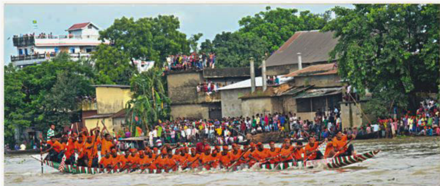
Enthusiastic spectators watch as the boats race on.