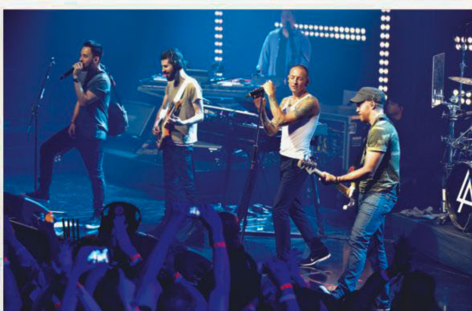
LP doing what they do best: Rocking out.

Linkin Park released their debut album in October 2000, and since then they've established themselves as the top new act of this millennium, with more than 24 million albums sold. And the crowd reaction at their New Jersey stop on their Carnivores Tour, streamed Friday night on Yahoo Live from Camden's Susquehanna Bank Center (New Jersey, USA), made it clear why. Linkin Park owe it all to their fans - who clearly still connect to the band's timeless themes of