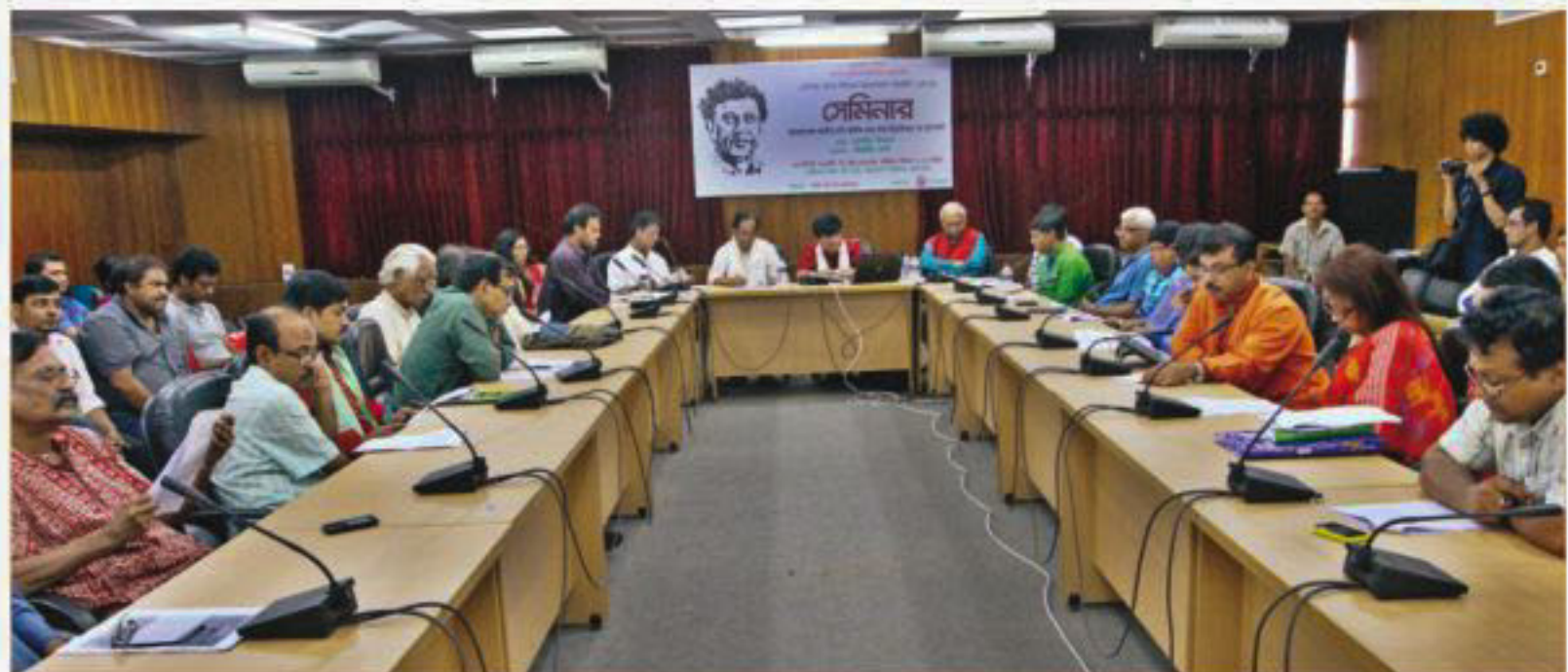
A scene from "Joiboti Konya'r Mon" (above); speakers at the seminar.

He explained how Selim Al Deen and Nasiruddin Yousuff together built up a format that reflects our own nationality and cultural roots. Selim Al Deen's plays strive to search our folk traditions and national