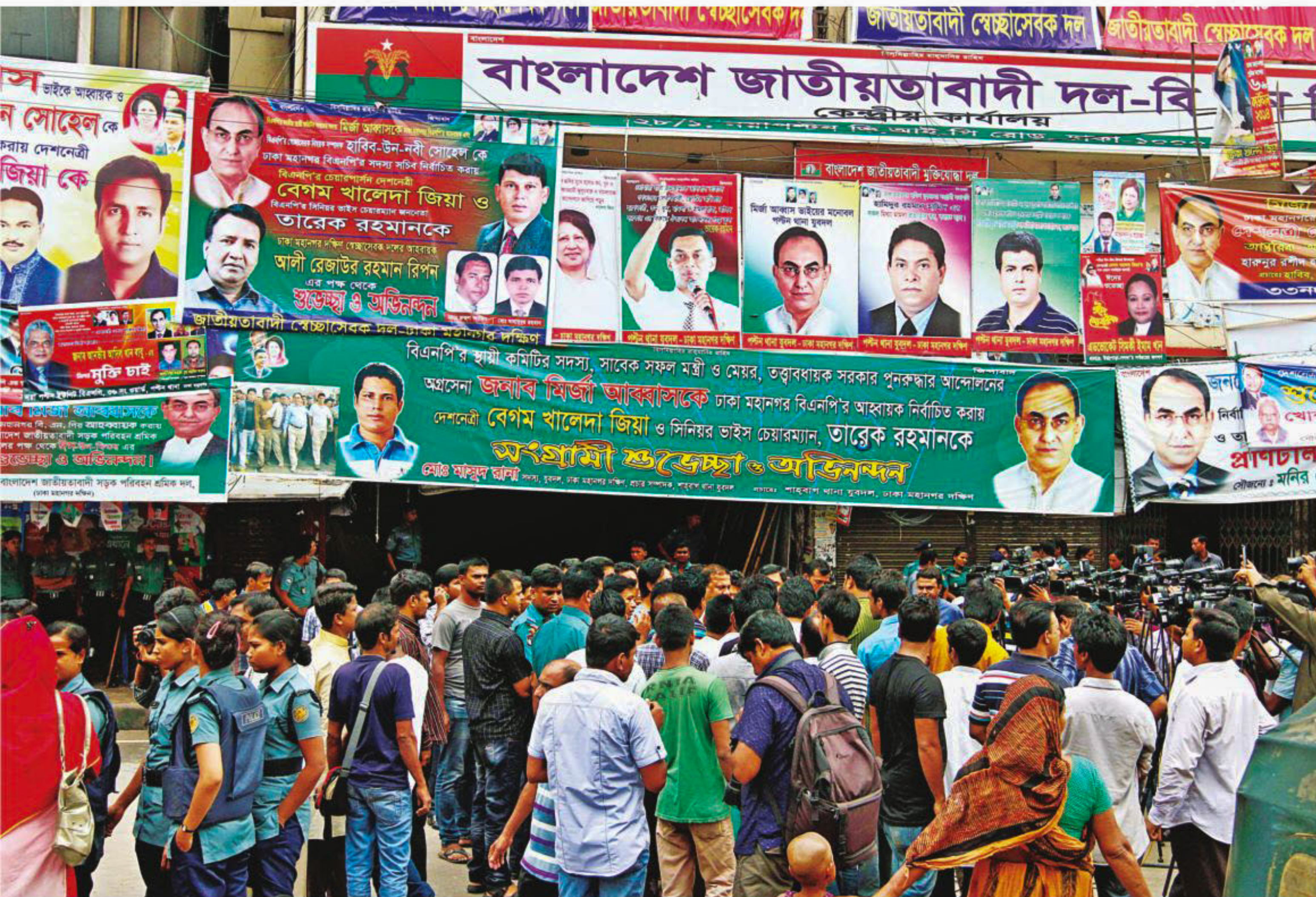
BNP activists and supporters gather in front of the party's Nayapaltn headquarters yesterday as police bar them from entering the office. Law enforcers had been guarding the place since morning.