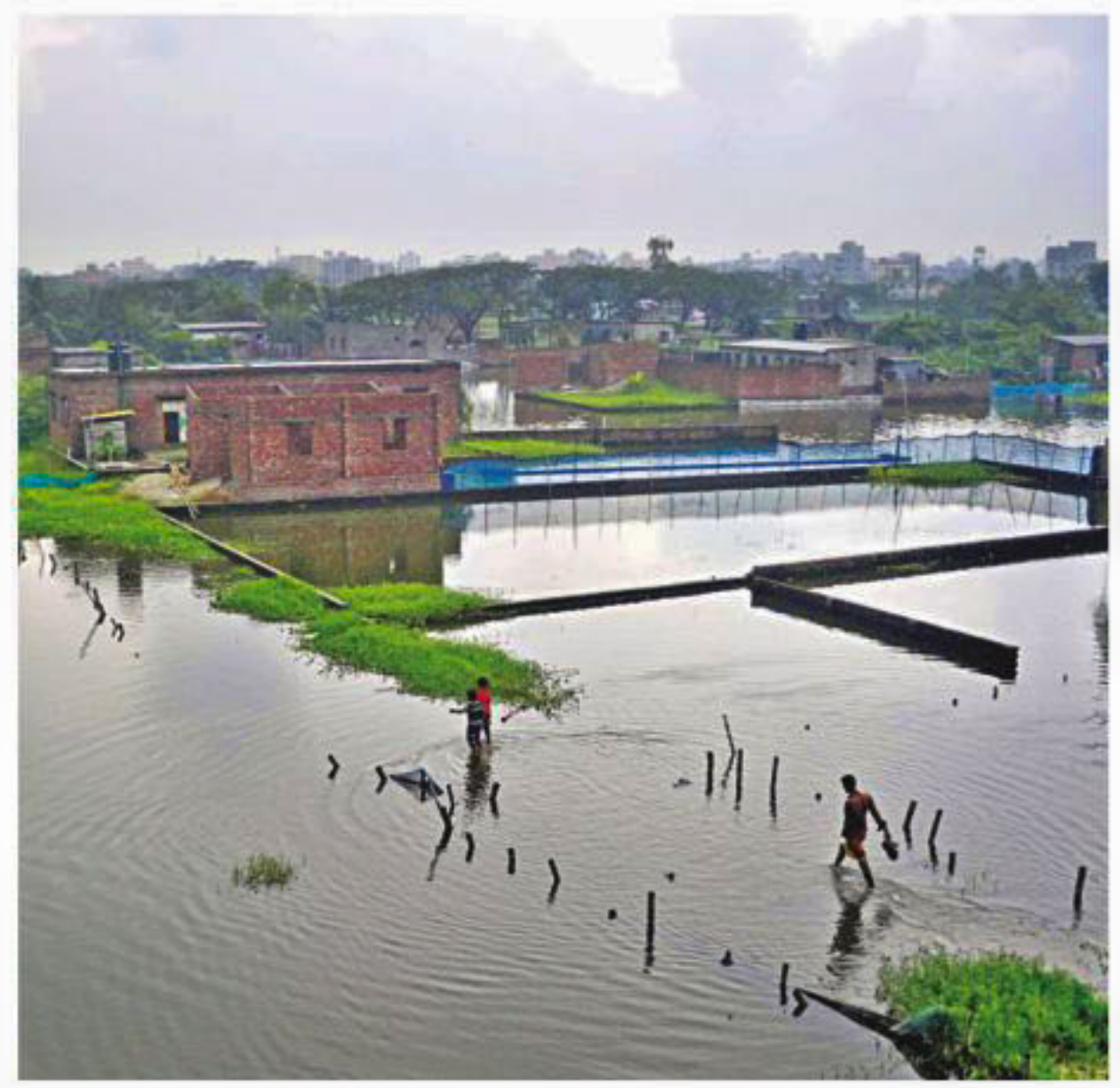
Left, Phulgazi Police Station in Feni is flooded with waist-deep water rushing through breaches on an embankment. Top, an area of Demra in Dhaka is water-logged following downpours over the last few days.