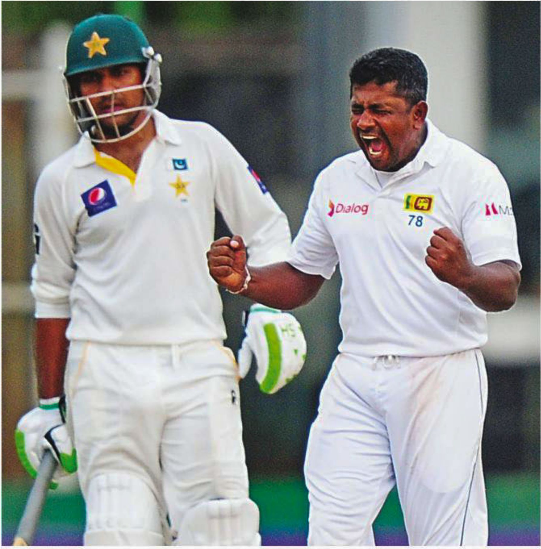
5-STAR RANGANA: Sri Lanka spinner Rangana Herath (R) exults after snaffling Pakistan batsman Asad Shafiq (not pictured) during the second day of the second and final Test in Colombo yesterday.

Spain then protested that Mekhiss-Benabbad should be disqualified from the race, citing rules on 'clothing, shoes and bibs'.