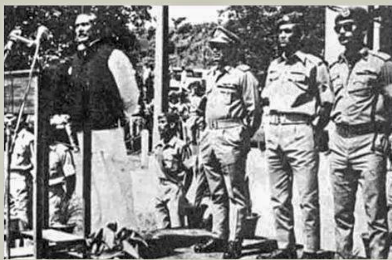
Bangabandhu Sheikh Mujibur Rahman speaks at the inauguration of Comilla Military Academy in 1973. Maj Gen Ziaur Rahman, then deputy chief of army staff, is standing, right, behind Bangabandhu.

As biggest beneficiary of Aug 15, he became chief martial law administrator, and finally, president