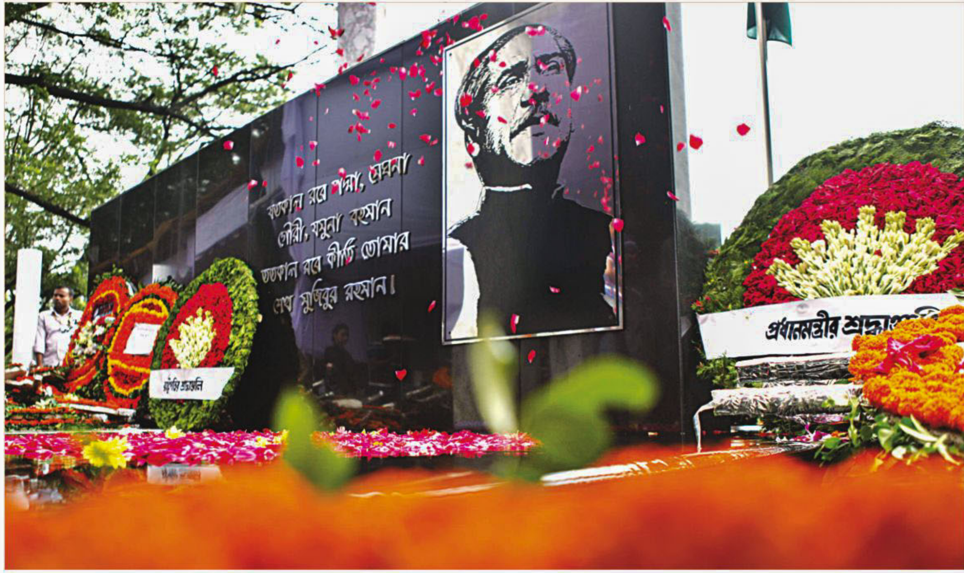
Floral wreaths placed by the president, the prime minister and socio-political leaders and organisations at the mural of Bangabandhu Sheikh Mujibur Rahman opposite to the historic Dhanmondi-32 house on the occasion of National Mourning Day yesterday.

Almost all launches of Mawa-Kawrakandi route plying without certified master, driver