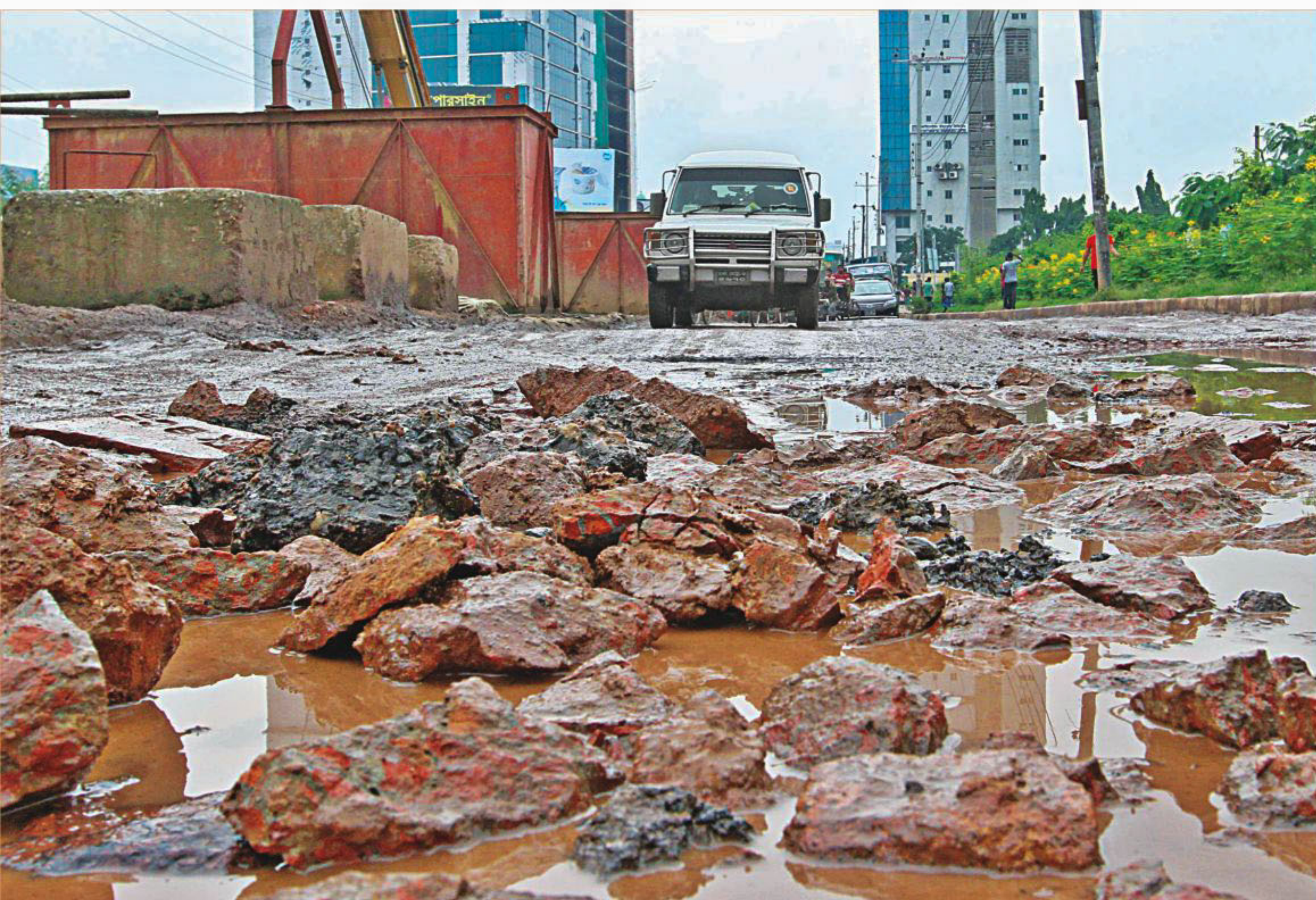
A road near the capital's Hatirjheel-FDC intersection has been left in an extremely bad shape following digging for Moghbazar-Mouchak flyover. Instead of carrying out repairs, the potholes developed during the work have been filled with chunks of concrete making the road bumpy. The photo was taken yesterday.