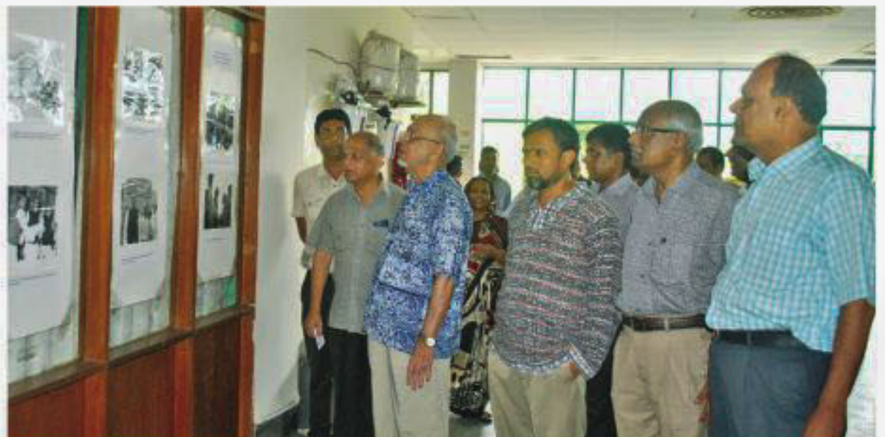
Visitors at the exhibition.

Discussions, a mourning procession and special prayers will also be offered today.