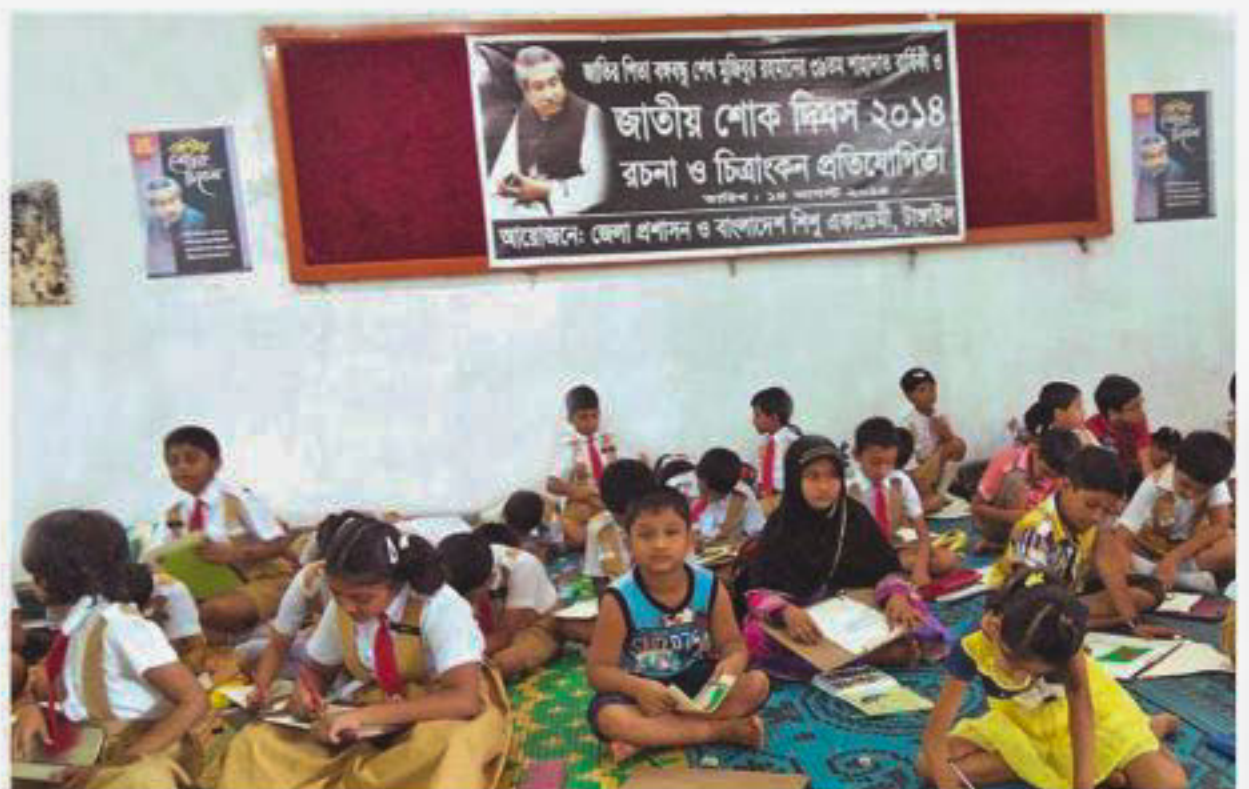
Children at the painting competition.