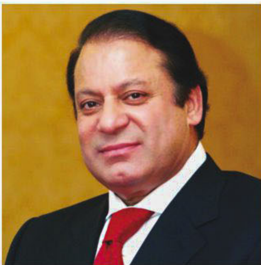
Muhammad Nawaz Sharif Prime Minister of the Islamic Republic of Pakistan

While felicitating the nation, I once again call upon every Pakistani to stand firm and united and work diligently for a progressive and prosperous Pakistan. Let us prove ourselves worthy inheritors of the invaluable reward that we have been bestowed by Almighty through untiring struggle of our forefathers. May Pakistan always enjoy the bounties of peace and prosperity.