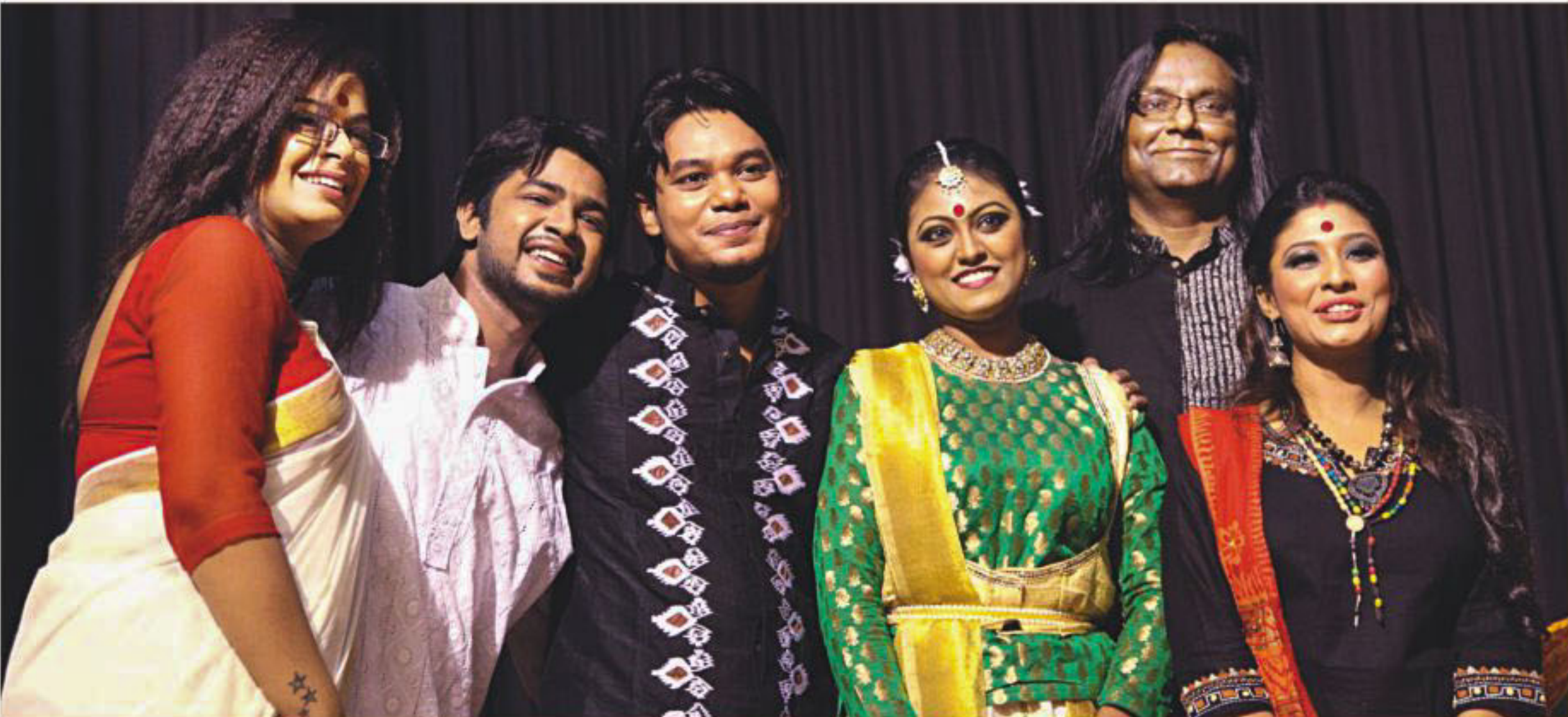
Bangladeshi artistes pose for a photo after the performance.

And last but not the least, Kalamandalam Gautam