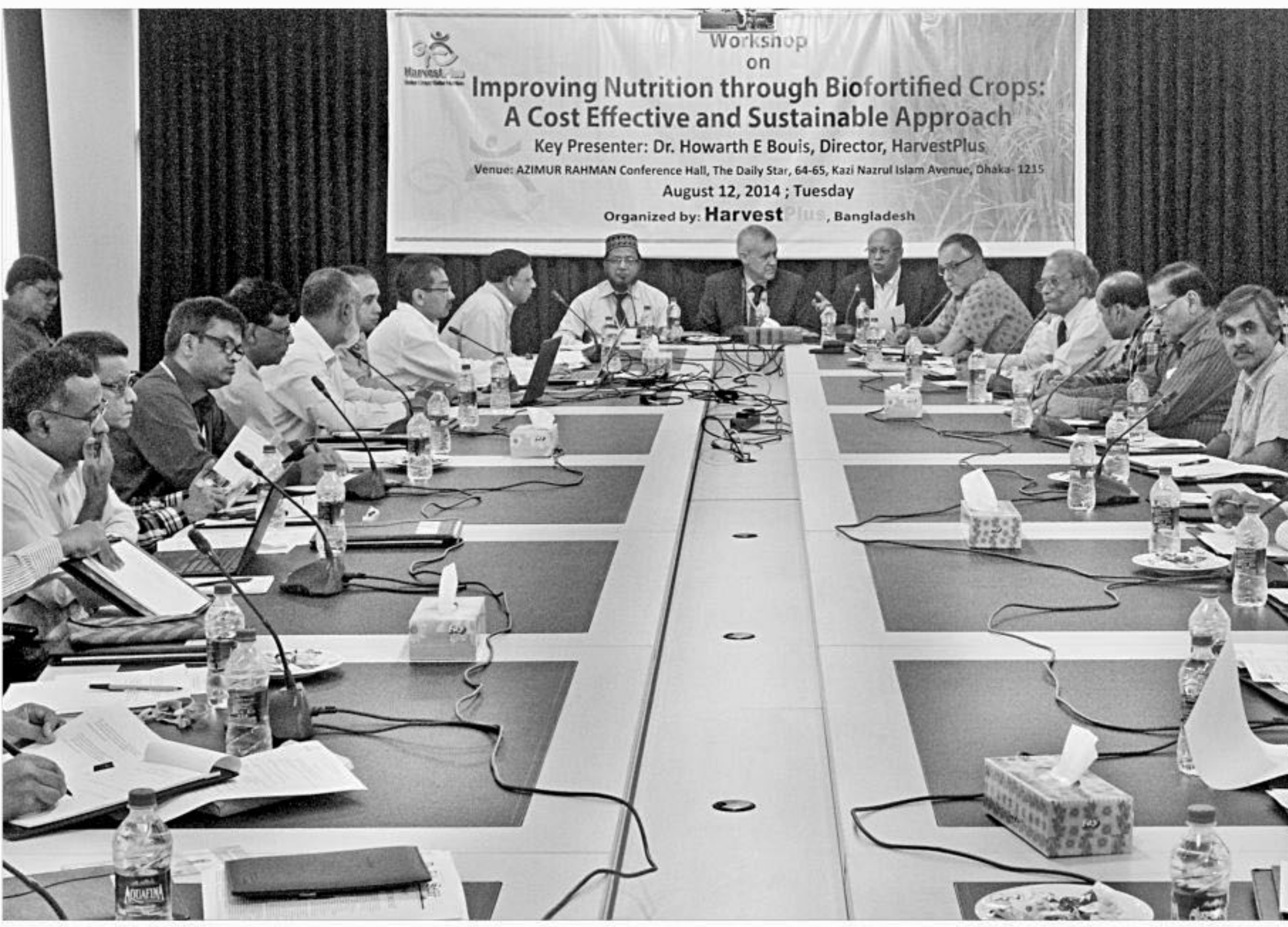
Participants at a workshop on "Improving Nutrition through Biofortified Crops: A Cost Effective and Sustainable Approach" at The Daily Star Centre in the capital yesterday. HarvestPlus, Bangladesh, an NGO which develops nutrient-rich seeds, organised the programme.

Bangladesh wants to go beyond government machineries, if necessary, to mobilise international support for brining back fugitive convicted killers of Father of the Nation Bangabandhu Sheikh Mujibur Rahman at any cost to execute the death penalty given to those who took shelter in foreign lands, said State Minister for Foreign Affairs M Shahriar Alam yesterday. It also wants foreign countries to treat the issue of repatriating convicted killers as an "exceptional case" and repatriate those killers by amending their respective laws, if necessary, he said. The state minister came up with the remarks when government diplomatic efforts over the last few years apparently went in vain regarding repatriation of the convicted killers. "We respect their laws but they must respect our laws as well. It's an exceptional issue and there're exceptions," Shahriar said while talking to reporters. He said there would be no legal barriers if the countries where the killers took shelters agreed on the matter. "Principle agreement is urgent." In January 27, 2010, five condemned killers of Bangabandhu were hanged at Dhaka Central Jail.