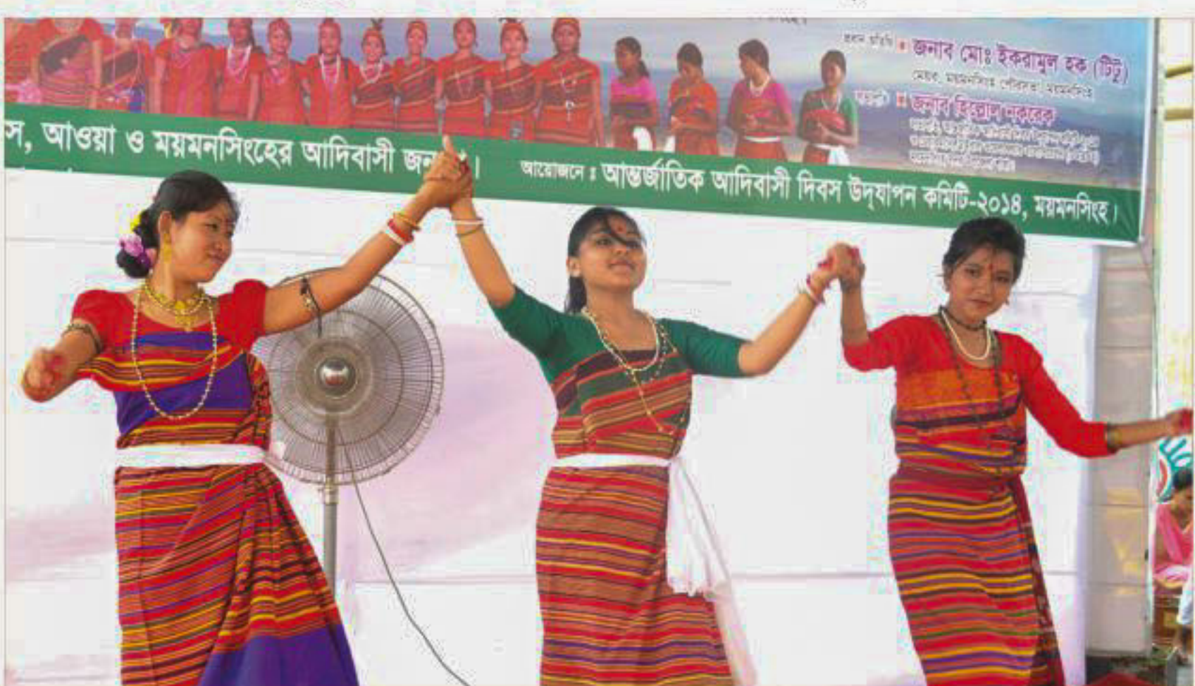
Hajong girls dance at the programme in Mymensingh.

Artists of Tribal Welfare Association, Garo Chhatra Union, Bangladesh Garo Chhatra Sangathan, Hajong Chhatra Sangathan and Achik Women Association performed at the cultural programme that included rendition of indigenous songs and performance of dance sequences. Wearing traditional dresses and