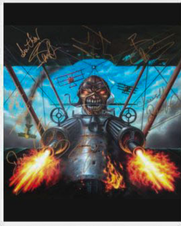
A signed Iron Maiden poster and an orange amp used by Black Sabbath are on sale.

Money raised will go to the Teenage Cancer Trust, Childline and Nordoff Robbins Music Therapy. Organised by Heavy Metal Truants in association with TeamRock.com, bidders from around the world will be able to get involved in the hope of getting their hands on more than 80 listed goods. They include guitars, amps, T-shirts, posters, box sets, rare pressings of albums, set lists, an entire sound system and even a