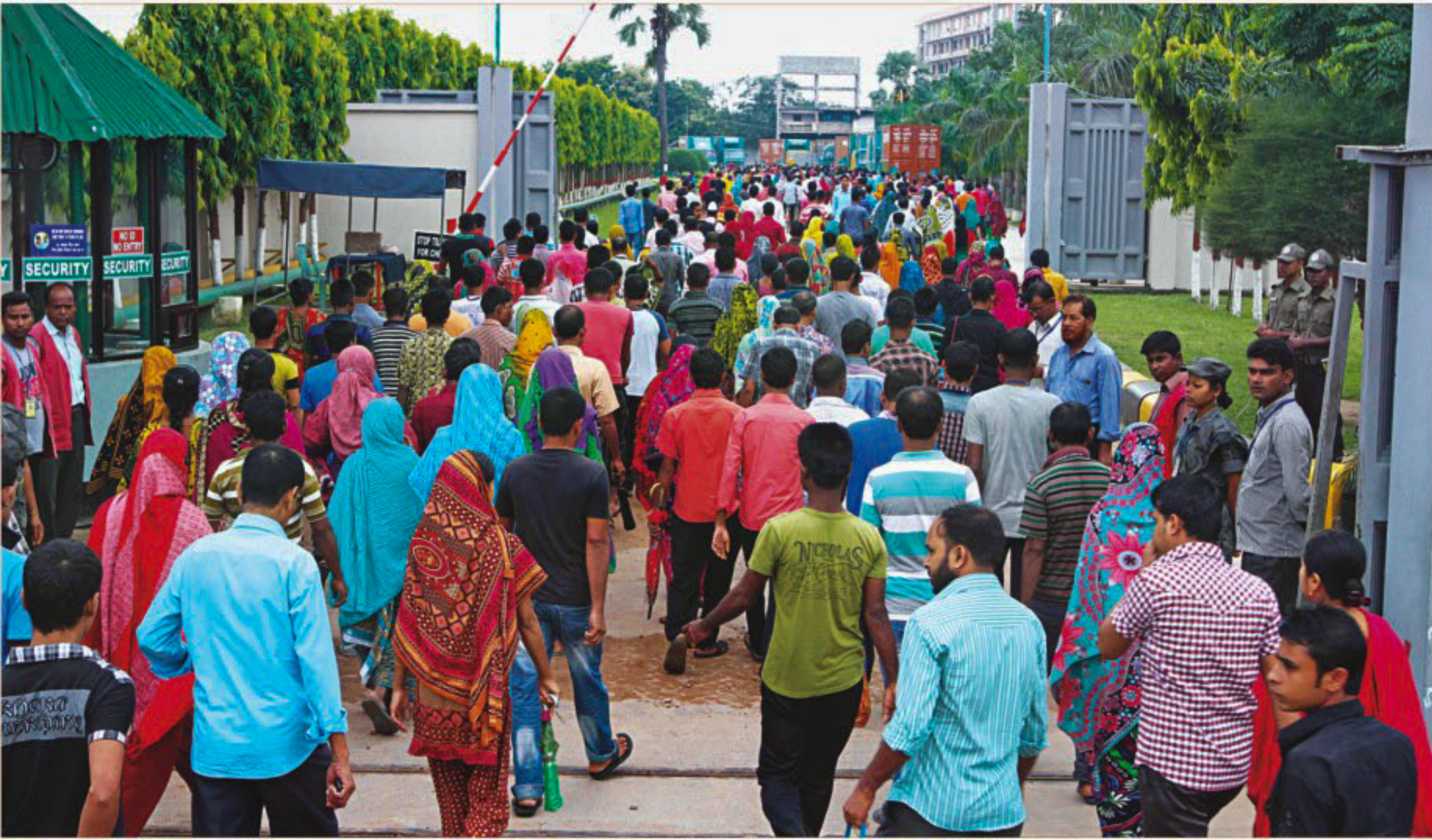
Garment workers of a factory in Ashulia report to duty as usual yesterday, defying a strike called by Tuba Group Sramik Sangram Committee, a temporary platform of 15 trade unions. Related story on page 16.