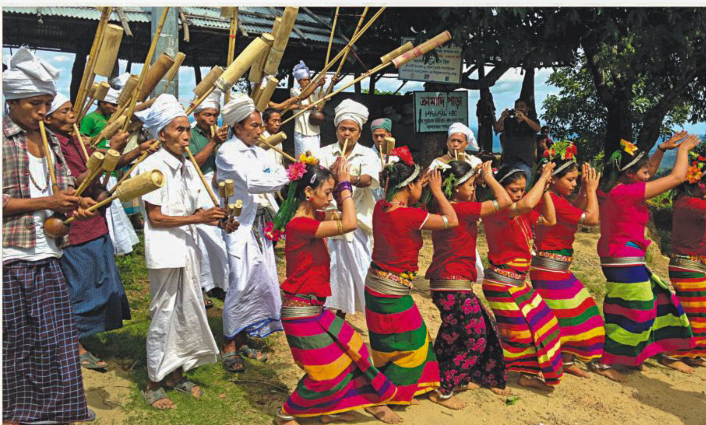
A cultural programme of Mro community at Cramadipara of Thanchi in Bandarban. Their culture and livelihood have increasingly come under threat with their farmland and ancestral homes being taken over. The photo was shot recently.