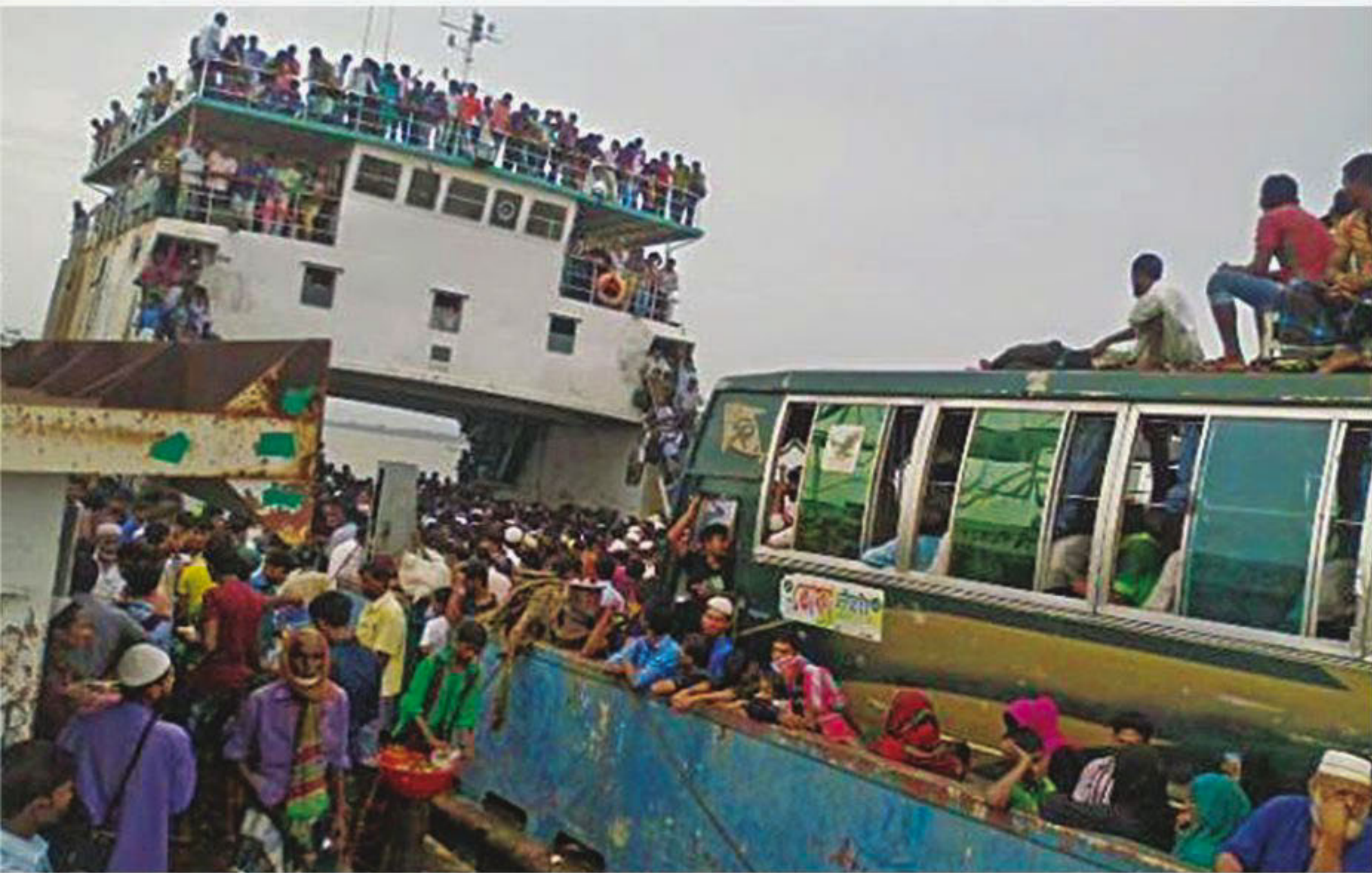
An overcrowded ferry at Elisha terminal in Bhola yesterday. As sea truck services remained halted amid bad weather, people went for ferries. Story on page 12.