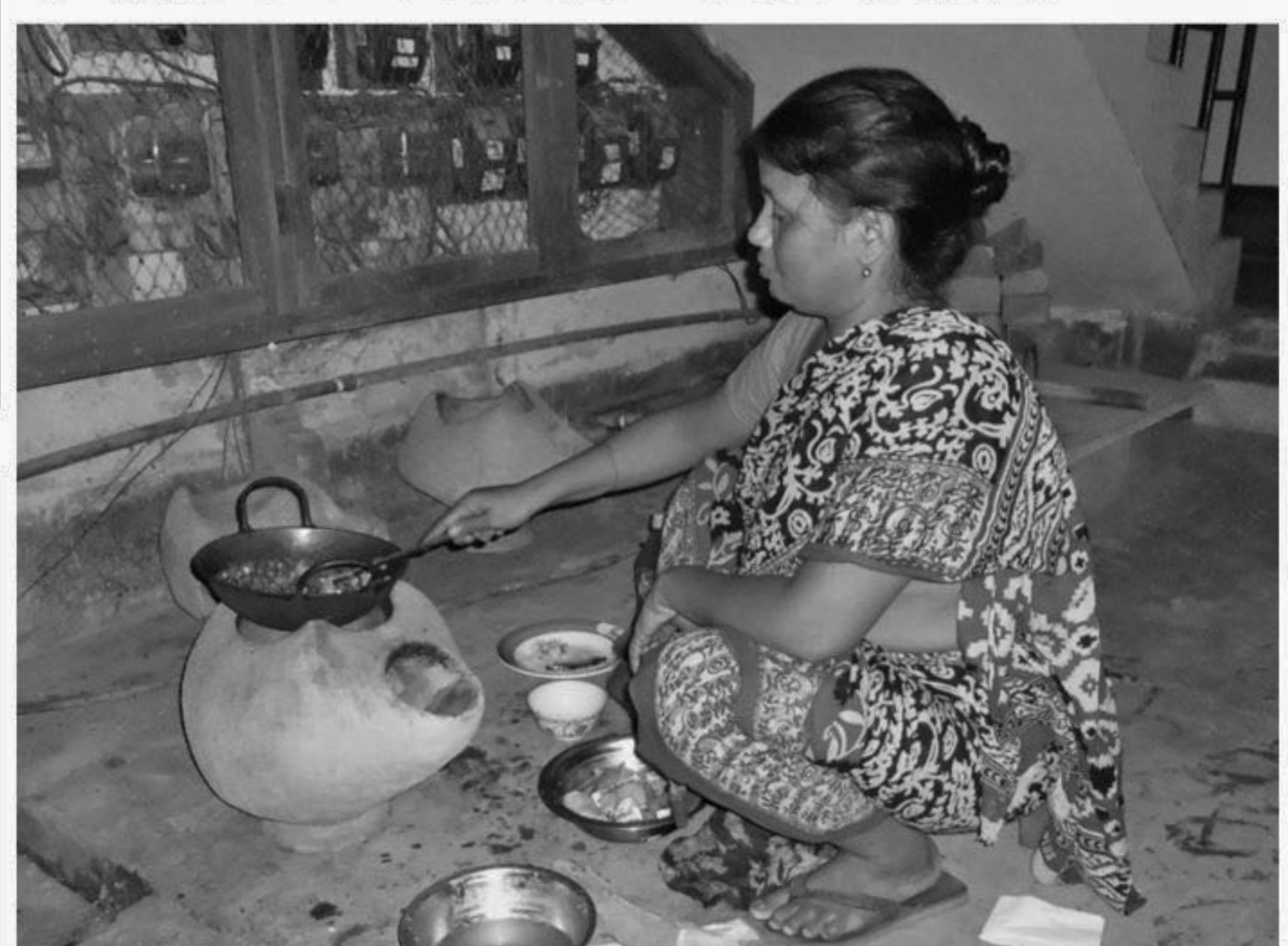
A woman cooks on an earthen stove at her Gangadharpatti house in Manikganj municipality as the area hardly sees adequate gas supply.