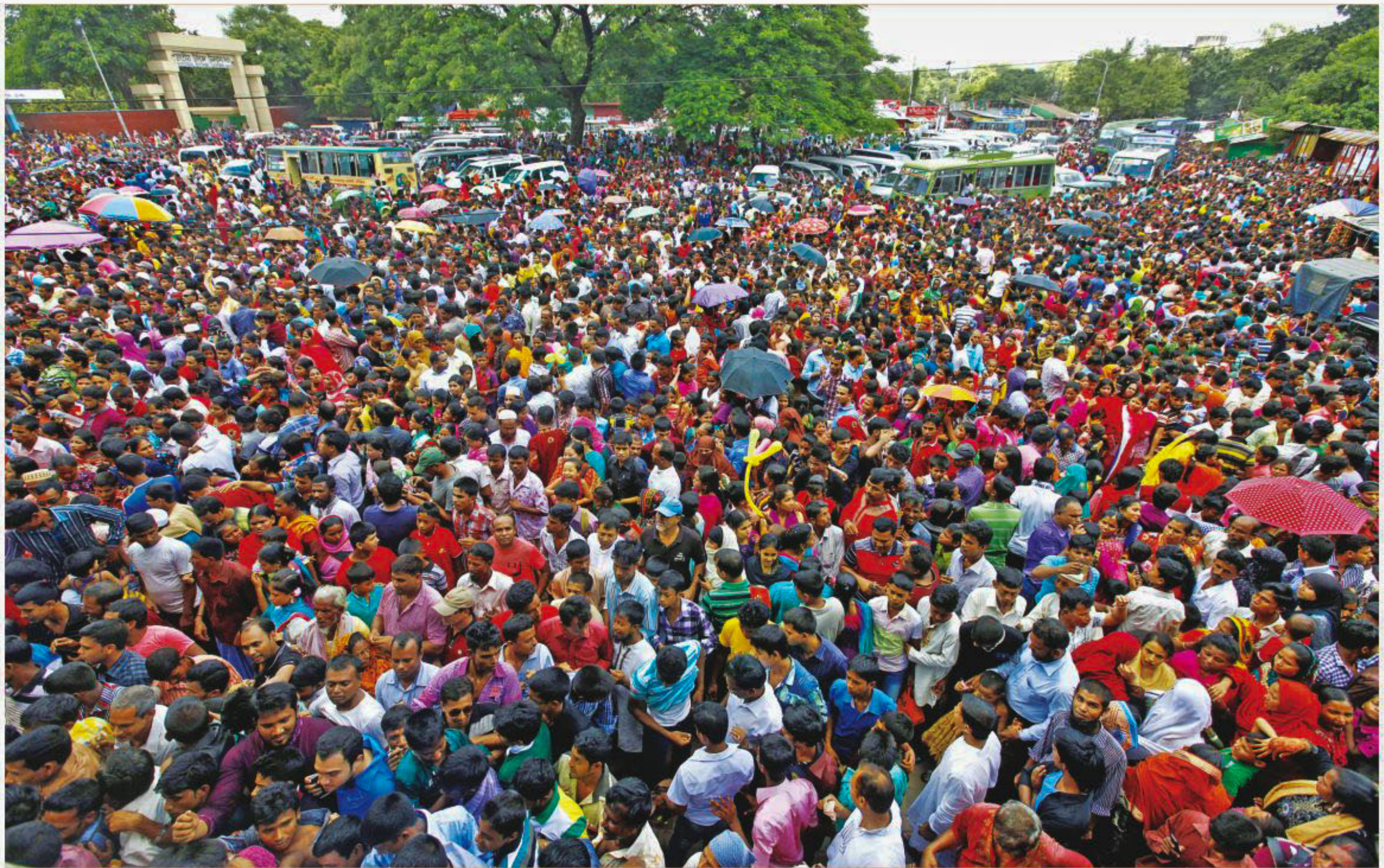
With a handful of recreational facilities available in Dhaka, people, some with children, crowd in front of the gate of Dhaka Zoo a day after Eid to get in. More on Eid celebrations on page 16.