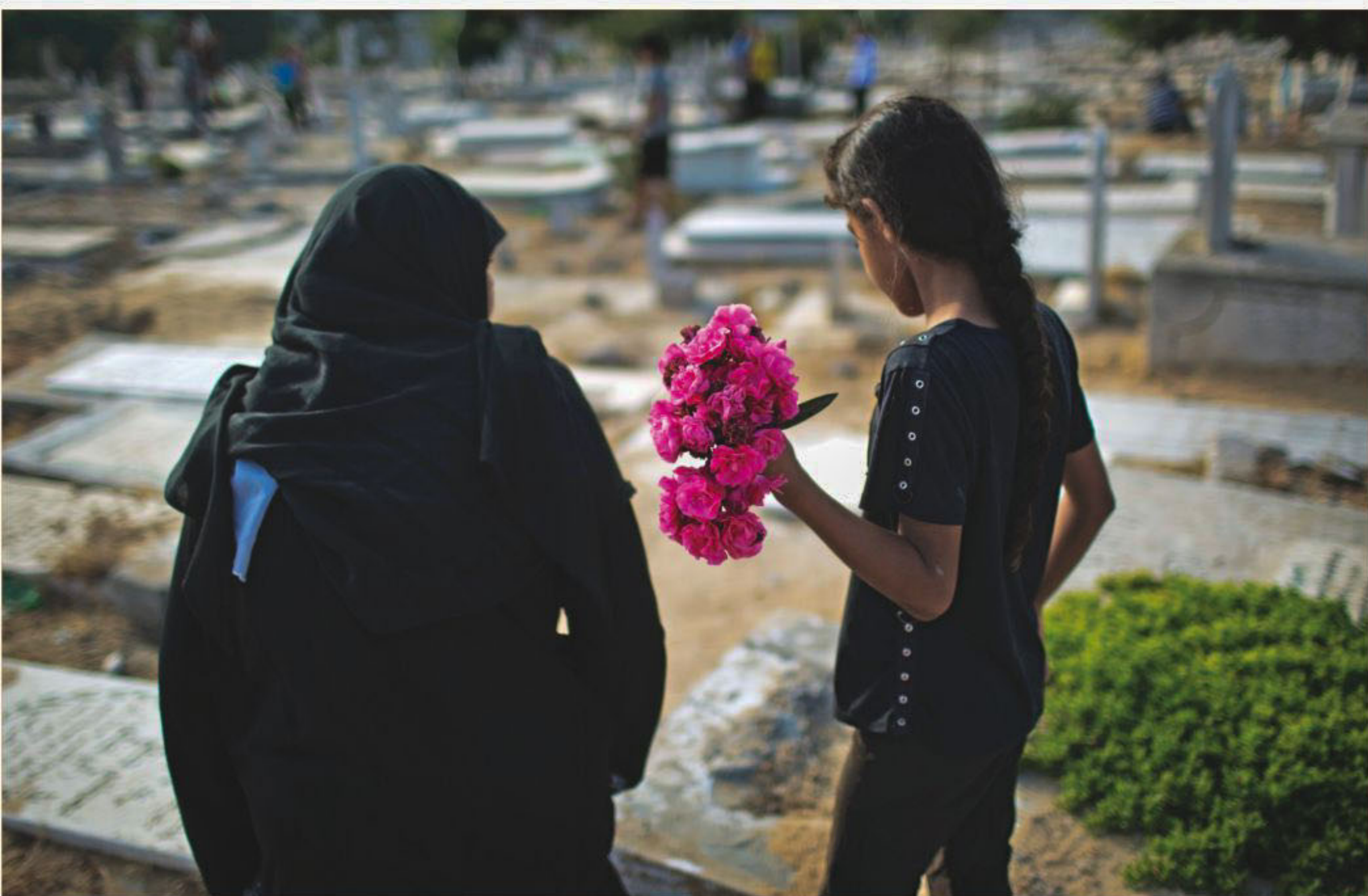
A Palestinian woman and a girl carry flowers to a family grave on Eid day at a cemetery in Gaza City on Monday.