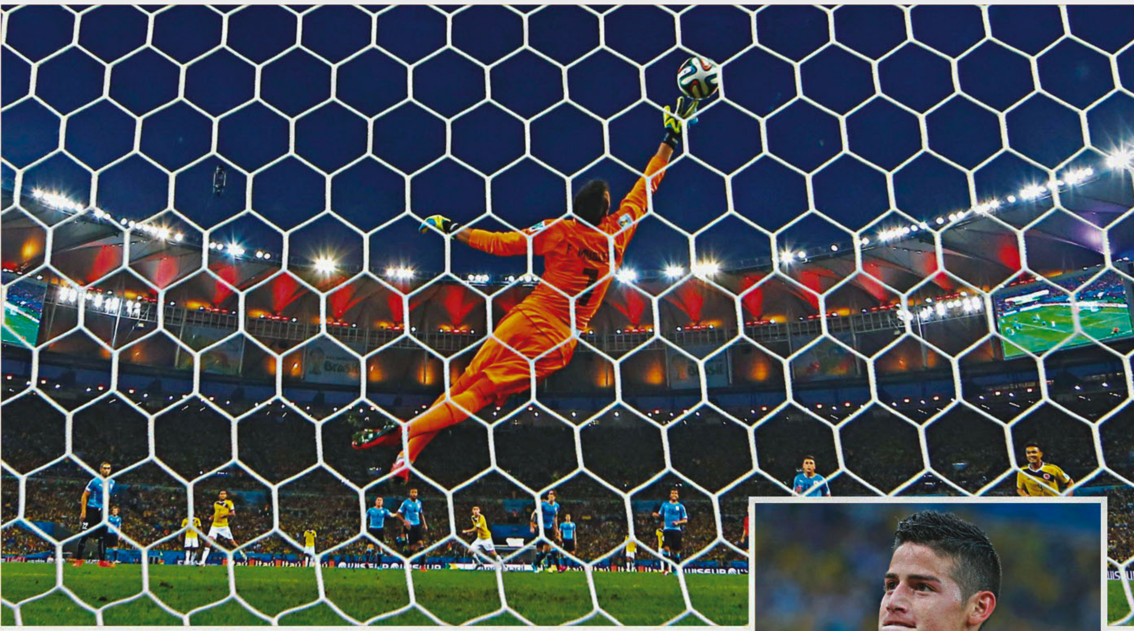
The just-concluded FIFA World Cup 2014 in Brazil produced 171 goals. Among them Colombia's James Rodriguez's magnificent left-foot volley against Uruguay in a Round of 16 match on June 28 at the Maracana Stadium in Rio de Janeiro has been voted by users of FIFA.com as the Goal-of-the-Tournament. Here is the goal and a celebrating Rodriguez, who also won the golden boot for scoring highest 6 goals in the showpiece event.